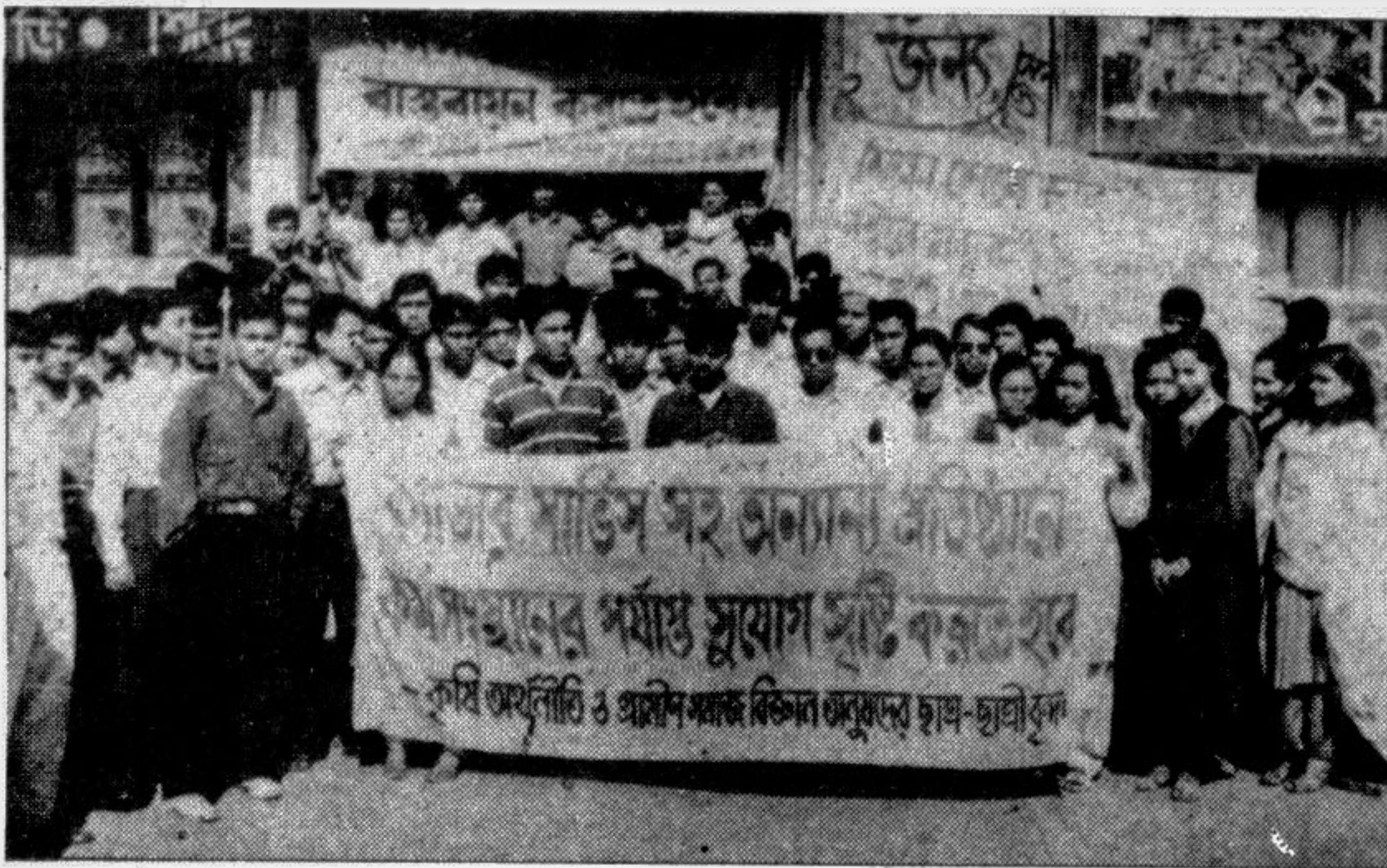
MYMENSINGH: The students of the Faculty of Agricultural Economics and Rural Sociology of BAU brought out a procession here demanding job opportunities on December 5.

Each children attending the classes over 85 per cent days is being provided with 15 kilograms of wheat per month, an official handout said.