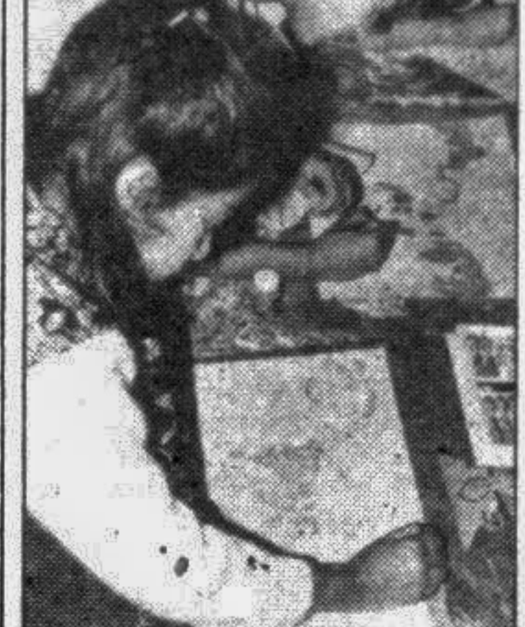
Children creating the world of their imagination at an art competition at the National Museum yesterday. Bangladesh National Museum, Chittagong Zia Memorial Museum, Sylhet Osmanly Museum and Mymensingh Zainul Abedin Art School have jointly organised the competition in observance of Victory Day.

After the seminar, prizes were distributed among the children who earlier participated in a painting competition on human rights.