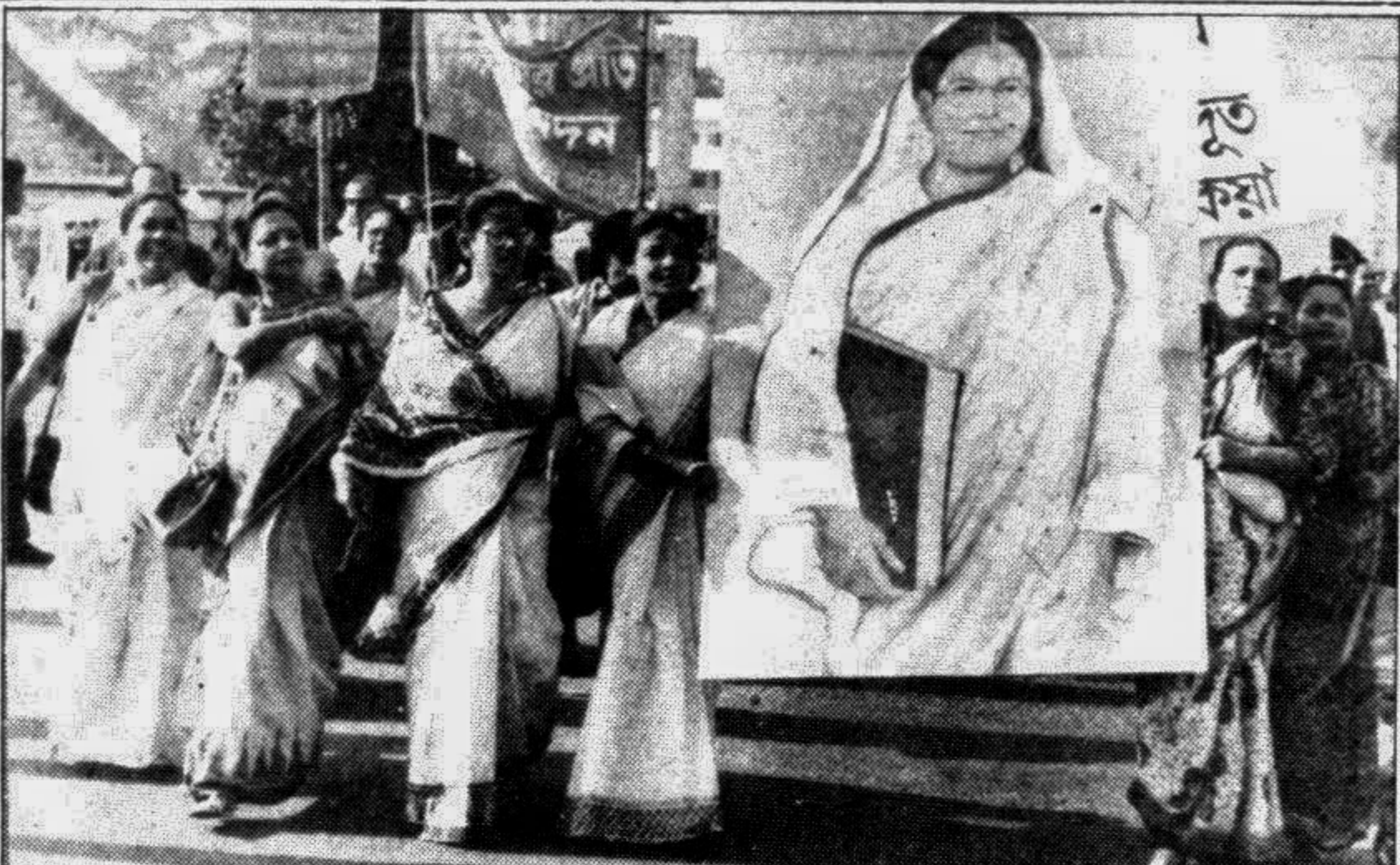
A silent procession was brought out in the city in observance of Begum Rokeya Day - the birth and death anniversaries of the pioneering champion for women's education - yesterday.