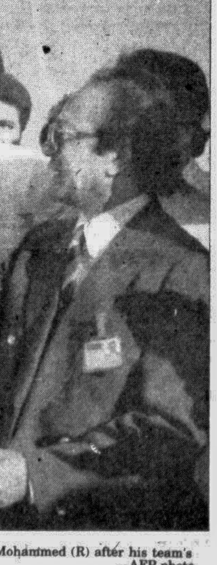
Pakistan captain Waqar Younis takes a bite of cake from former national skipper Hanif Mohammad (R) after his team's resounding victory in the one-off Test against Zimbabwe in Karachi on Dec 6.