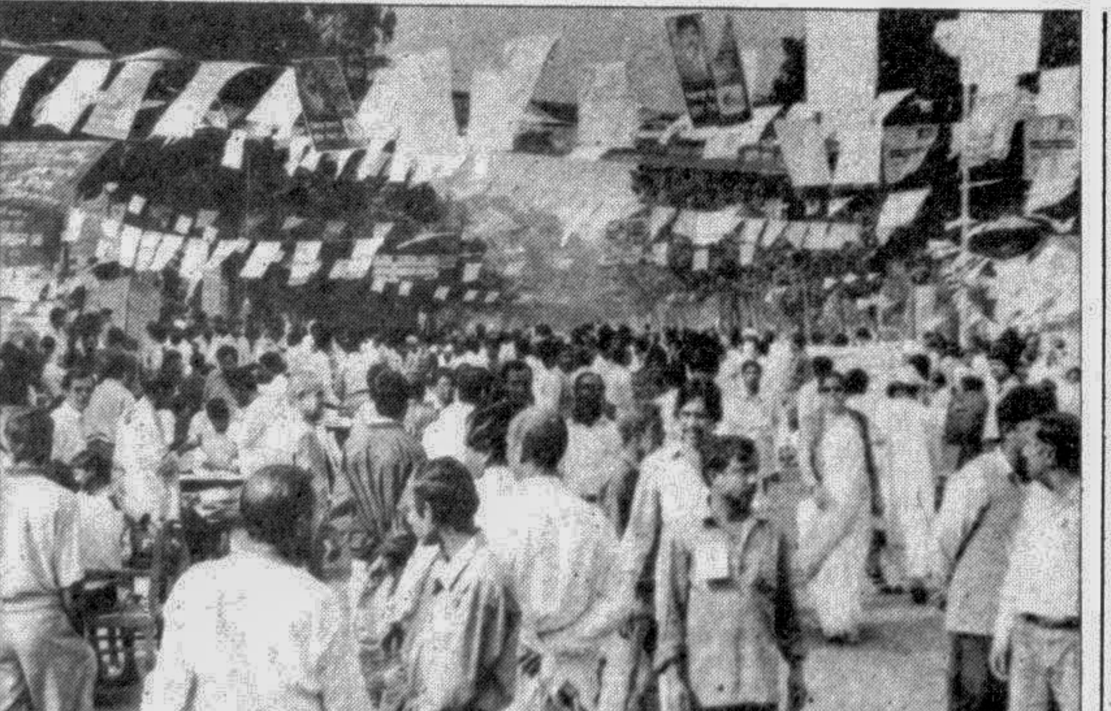
Members of the Bangladesh Secretariat Employees' Union held their elections blocking the Abdul Gani Road for the day yesterday.