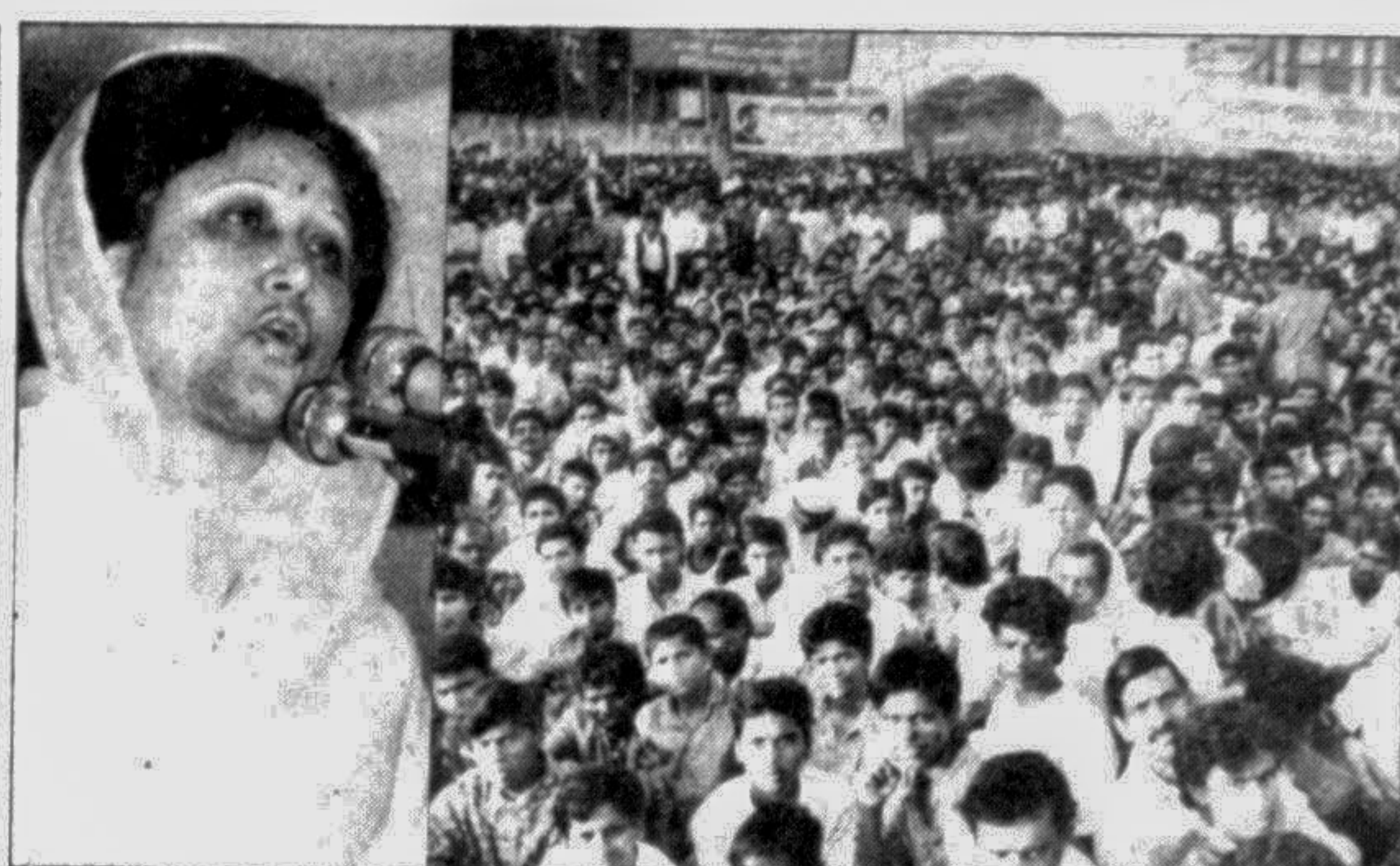
Prime Minister Begum Khaleda Zia addressing a public meeting in observance of the Democracy Day at the Democracy Square in the city yesterday.

She was accompanied, among others, by journalist Rahat Khan, film producer Abbas Ullah, artiste Tarana Halim and Sharmila Radha Eva.