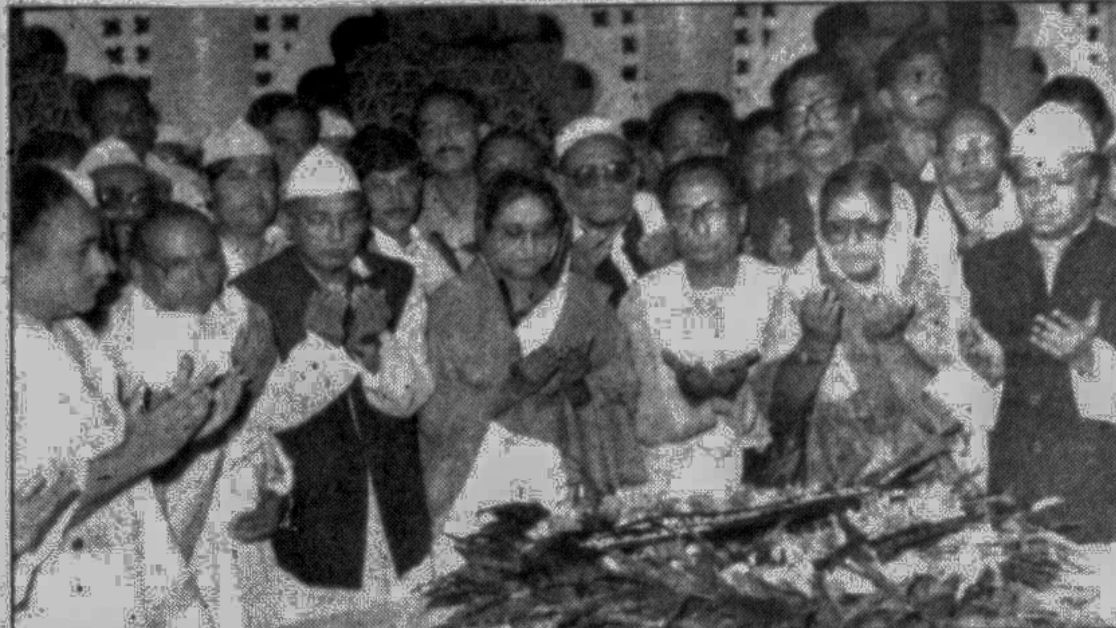
Awami League chief and Leader of the Opposition in Parliament Sheikh Hasina flanked by her party leaders offering feteha at the mazar of Hussain Shaheed Suhrawardy in the city yesterday.