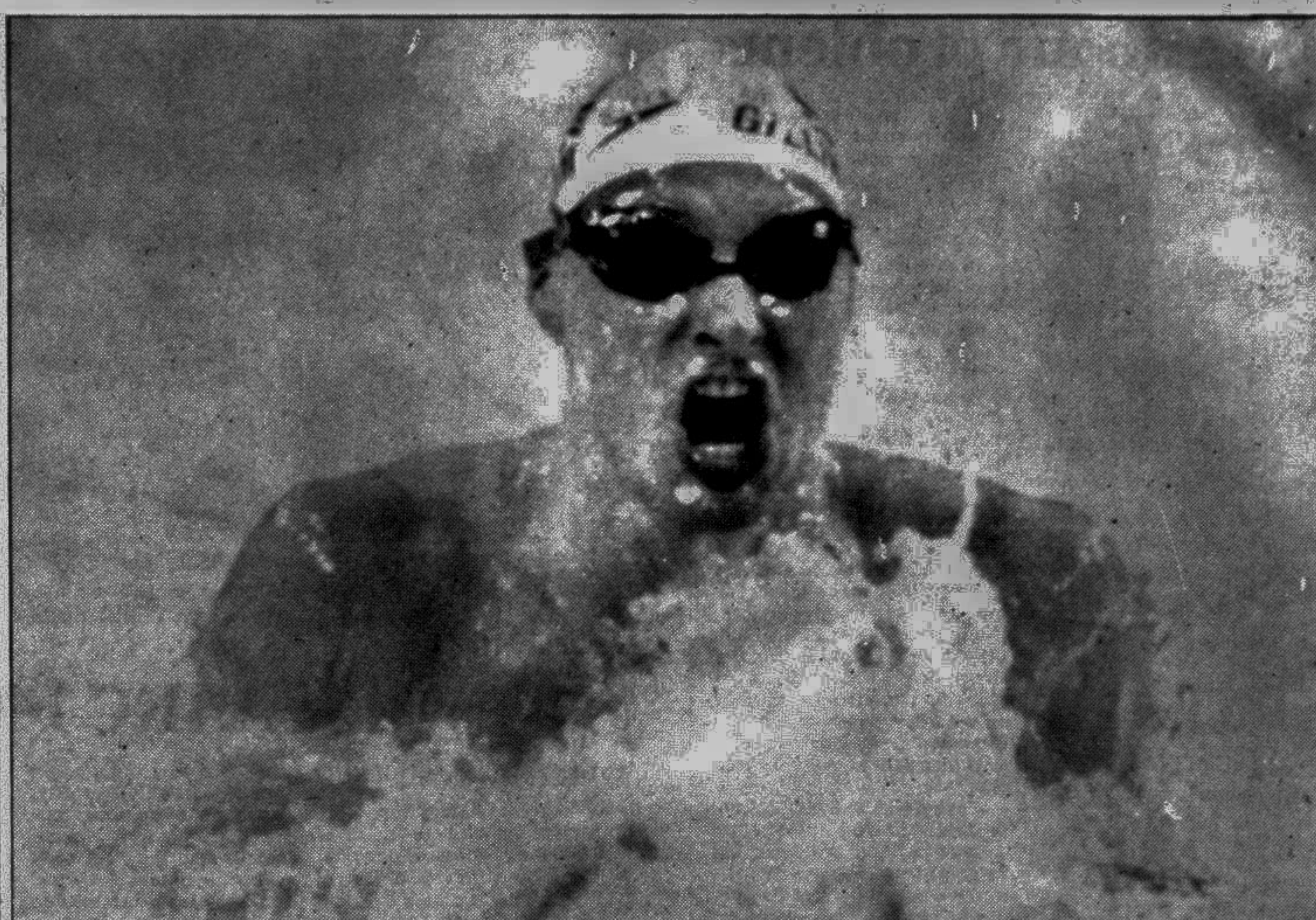
Briton Nick Gillingham sets a European record winning the men's 200 metres breaststroke in a time of 2-min 7.91 secs at the World Short-Course Swimming Championship in Palma de Mallorca, Spain on Dec 4. Gillingham broke his previous record of 2-min 7.93 secs set in Birmingham in October 1991.