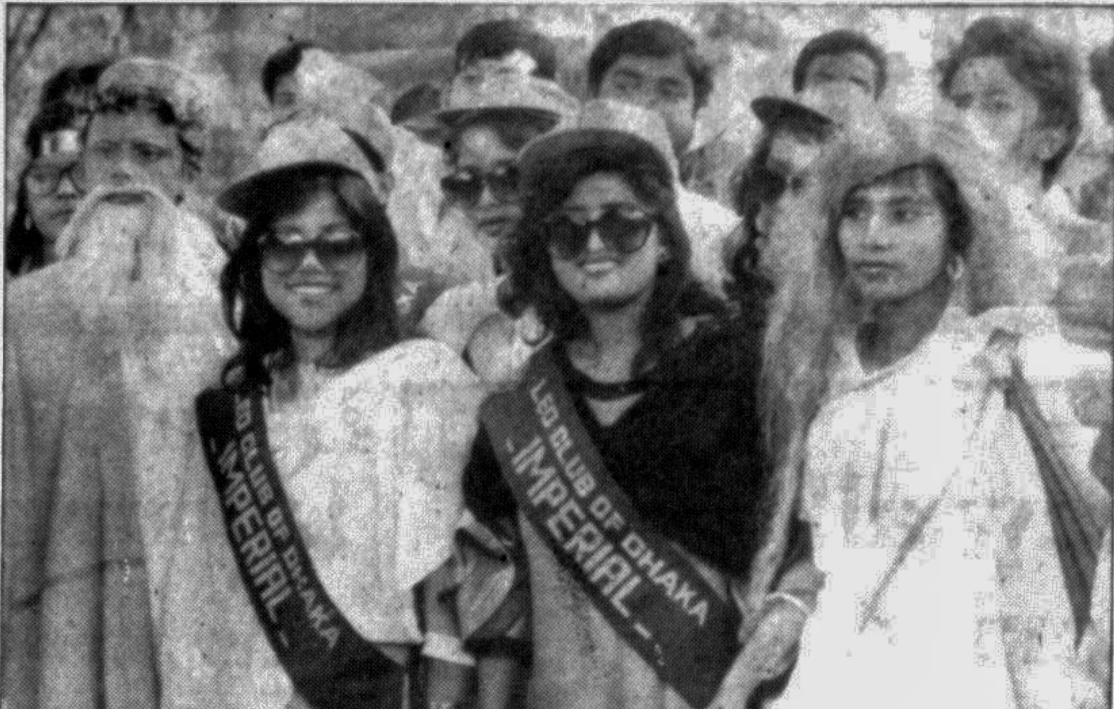
A colourful procession was brought out in the capital yesterday to mark the International Leo Day.