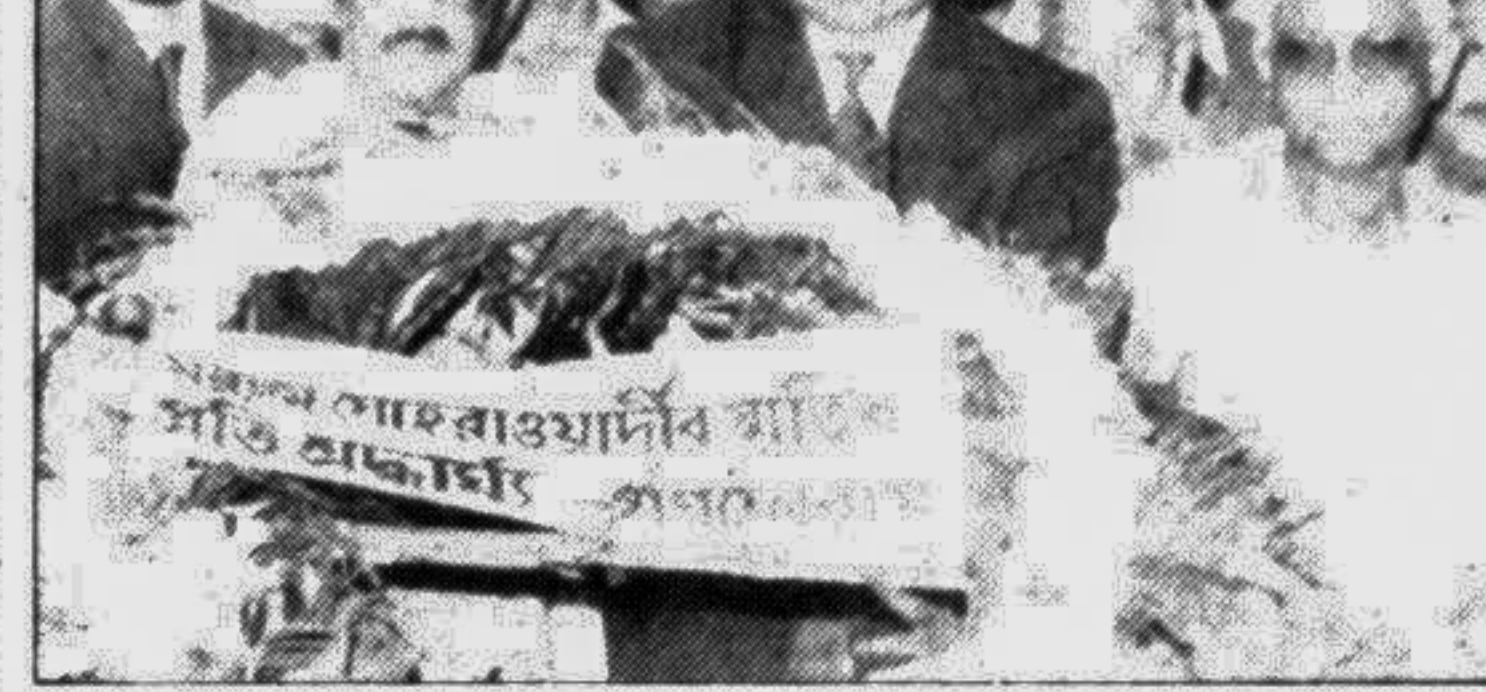
Leaders of the Gano Forum yesterday placing wreaths at the mazar of Hussain Shaheed Suhrawardy on the occasion of Suhrawardy's 30th death anniversary.

"As a result, sufficient awareness have been created", Mannan said, adding, "It is time to develop a national plan of action and formulate policies for achieving the goals of participation and equalisation of opportunities."