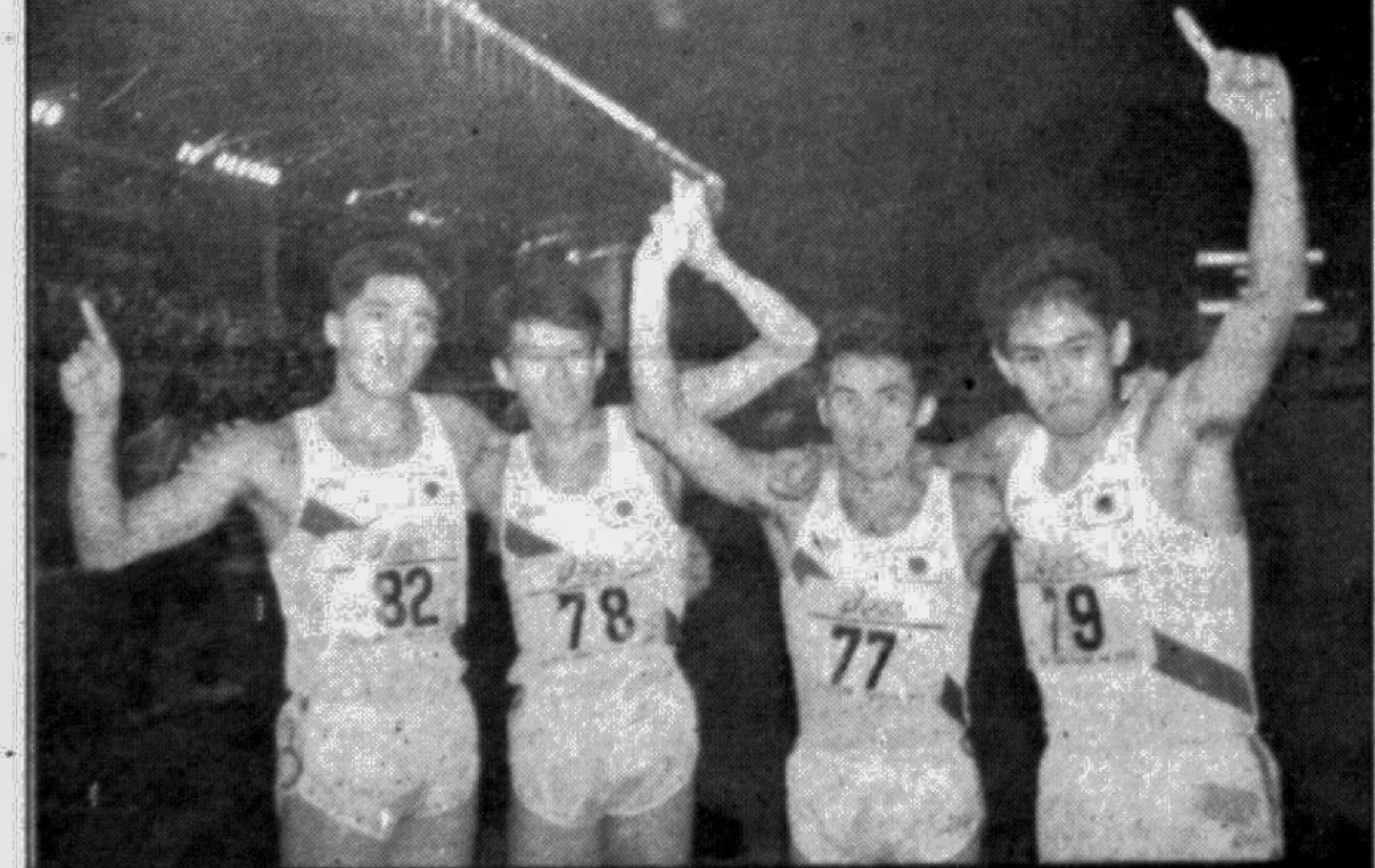
The victorious Japanese men's 4x400 metre relay team do a lap of honour after winning the gold medal in a time of 3 mins 9.03 secs on the closing day of the Asian Athletics Championships in Manila yesterday.