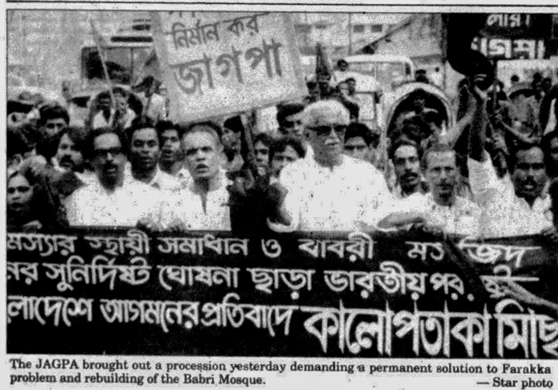
The JAGPA brought out a procession yesterday demanding a permanent solution to Farakka problem and rebuilding of the Babri Mosque.

All activities of the Demra Thana Jubo Dal has been suspended from yesterday until further order at the directive of the central council of the Bangladesh Jatyatabadi Jubo Dal, reports BSS.