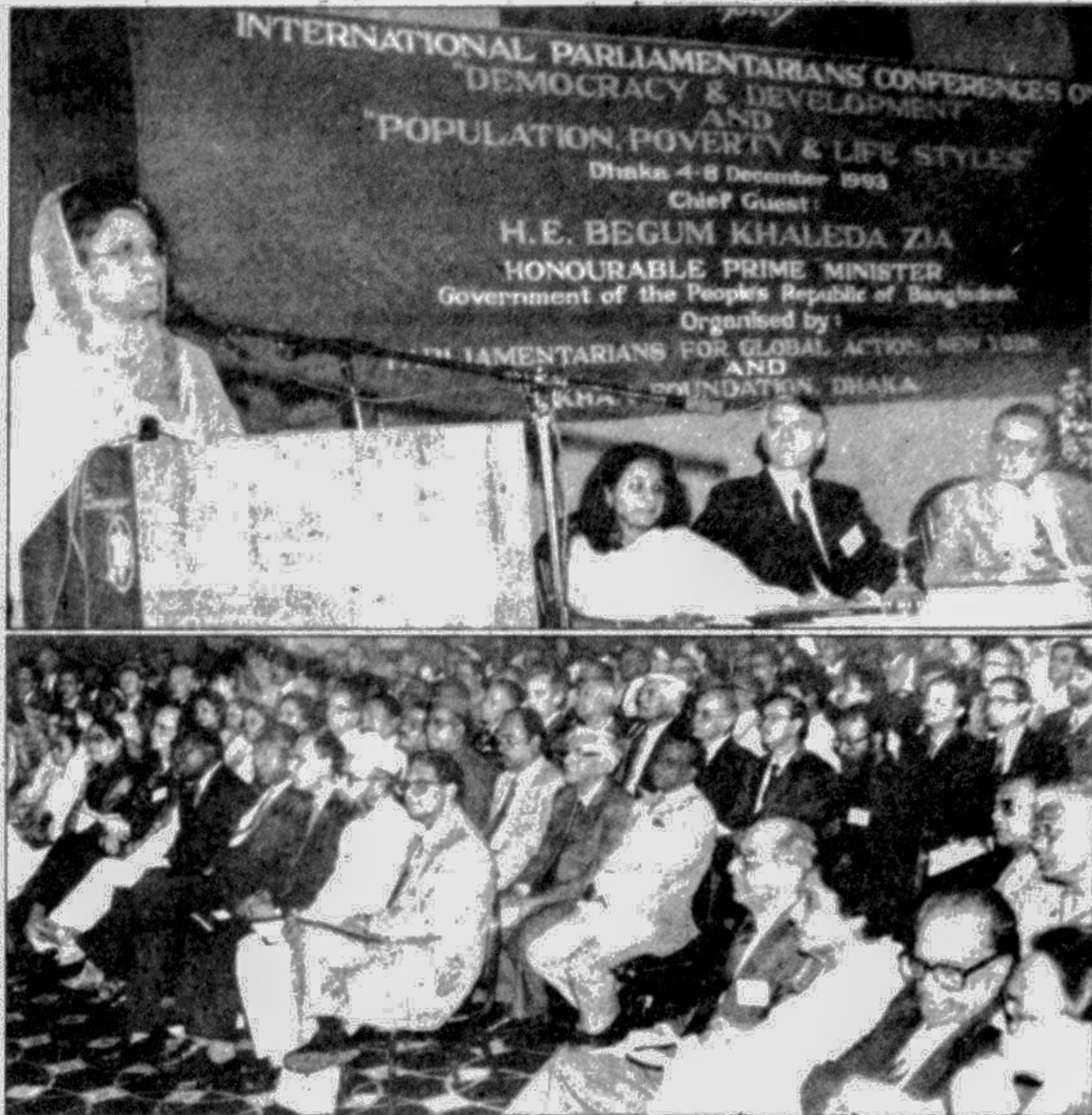
Prime Minister Begum Khaleda Zia speaking as chief guest at the inaugural session of the 5-day international parliamentarians' conferences on 'democracy and development' and 'population, poverty and life styles' at the Sonargaon Hotel organised jointly by the New York-based Parliamentarians for Global Action and Khan Foundation, Dhaka. Below: A section of local and foreign delegates at the conference.

The Dhaka audience, starved of good play production, is bound to lap up this effort of over a hundred people. And it is not often that Shakespeare is produced in its original form.