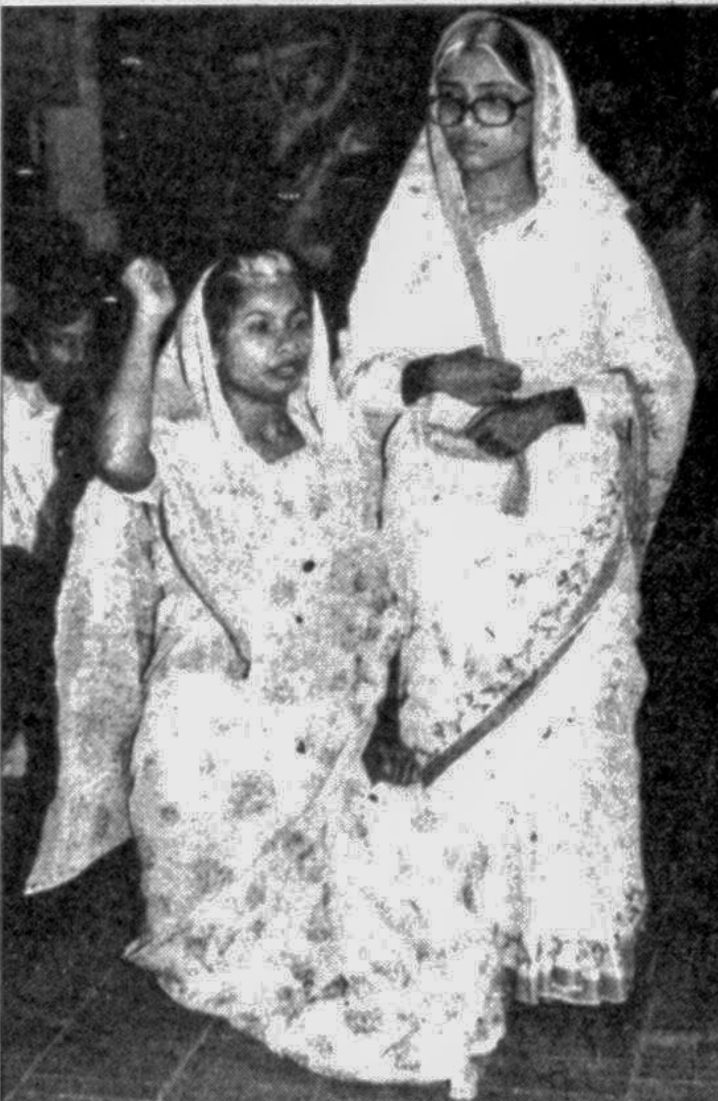
A scene of the drama Ghatak on the second day of the ongoing "Street Drama Festival to mark the Liberation War" staged at the Jatiya Shaheed Minar yesterday. The Samoy, a cultural group, organised the festival.