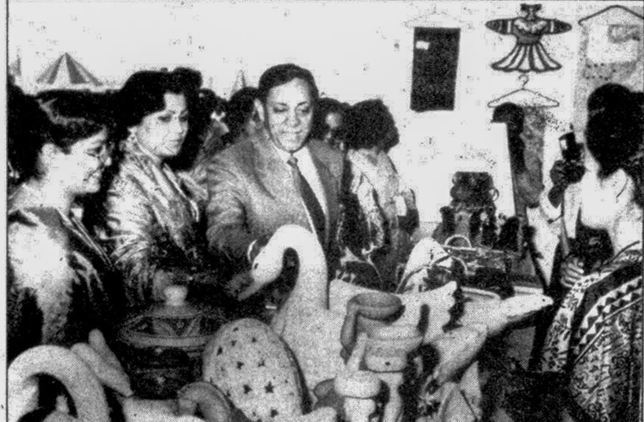
Chief of Army Staff Lt General Muhammad Noor Uddin Khan visiting a stall after inaugurating the handicraft exhibition of Sena Paribar Kalyan Samity at Dhaka yesterday.

After inauguration, the chief of army staff and other distinguished guests went around different stalls of handicraft, garments and other attractive items.