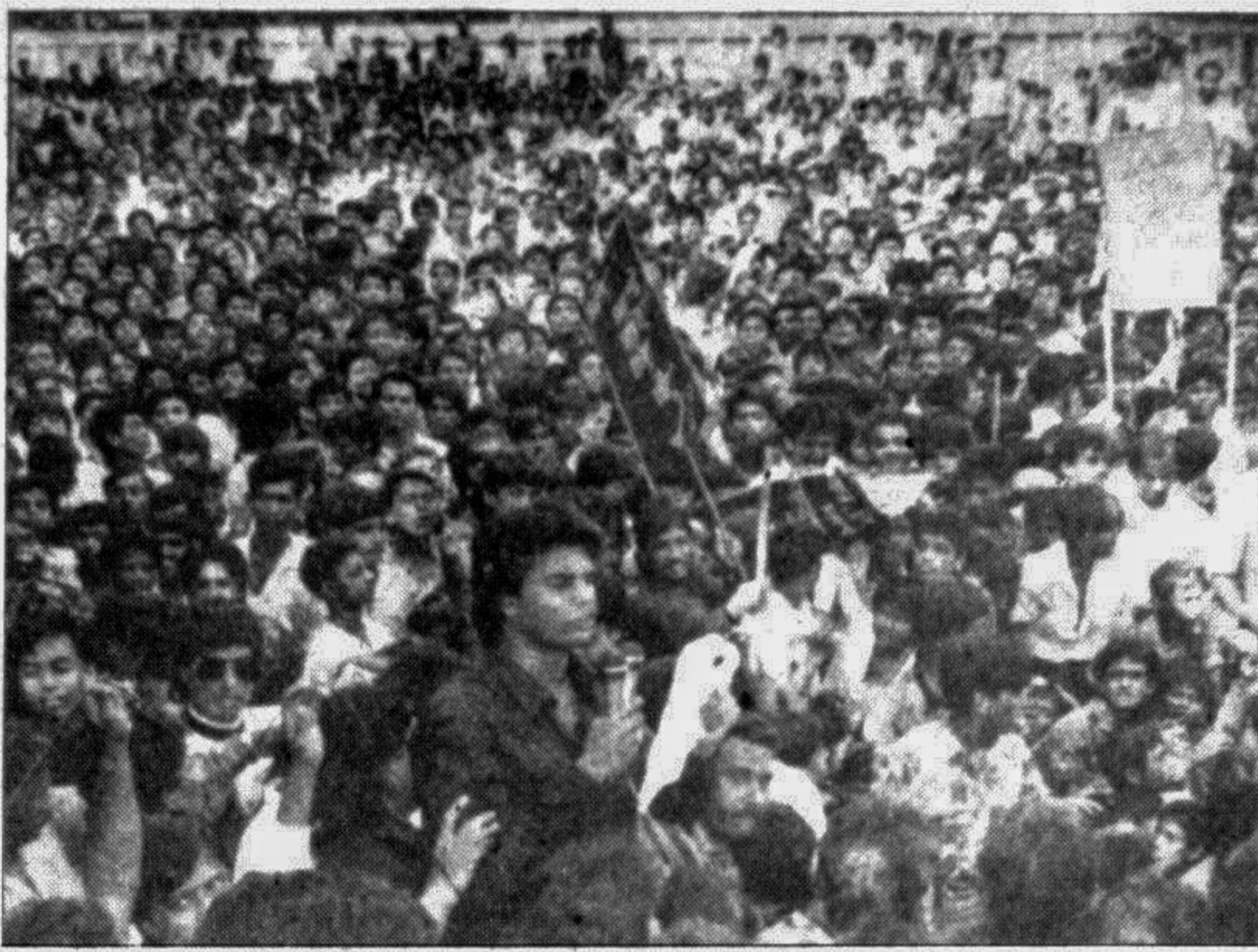
Ilias Kanchan, a leading film actor, addressing a rally under the banner 'We Want Safe Roads' to develop social awareness to check road accident. A procession was brought out from the FDC in the city which dispersed at the National Press Club yesterday.

Another meeting of the IGG will be held at the end of this month to review the latest developments and take measures to implement the recommendations of the meeting of the SAARC Council of Ministers.