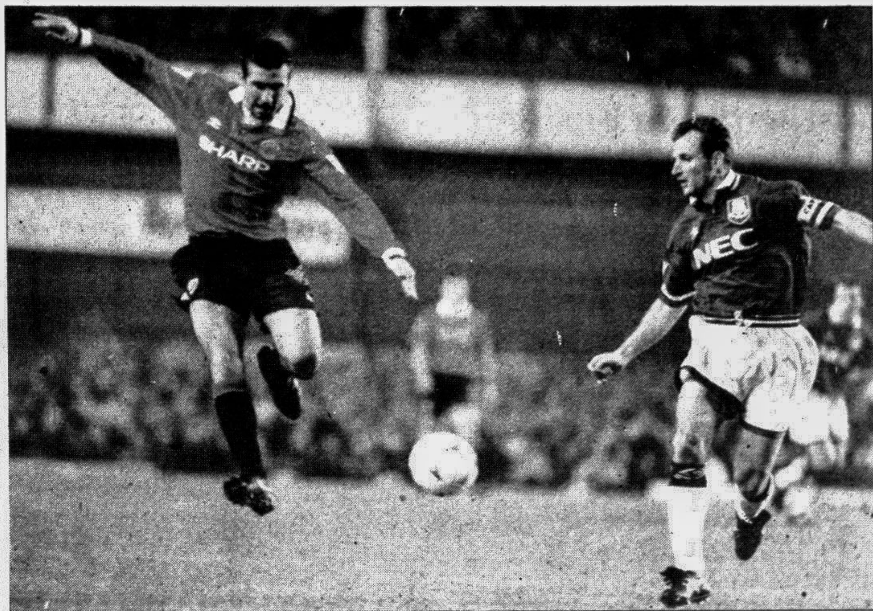
Manchester United striker Eric Cantona (L) pounces on to a ball with Everton's Dave Watson in hot pursuit during an English Premier League match at Everton's Goodson Park on Nov 30.