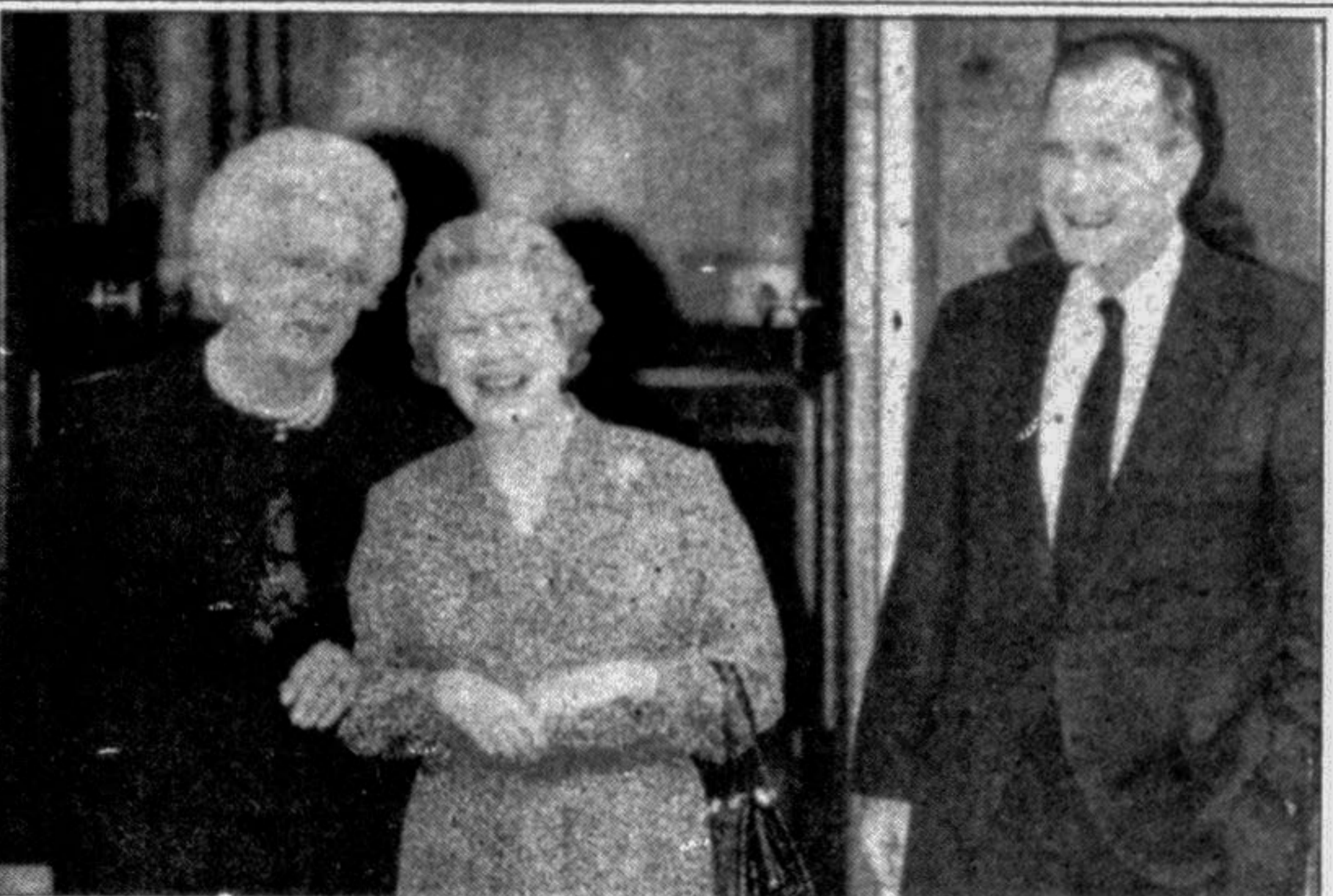
Britain's Queen Elizabeth II (C) shares a joke with former US President George Bush and his wife Barbara Tuesday in London, after Bush had been awarded an honorary Knight Grand Cross of the Order of the Bath by the Queen at a private lunch.