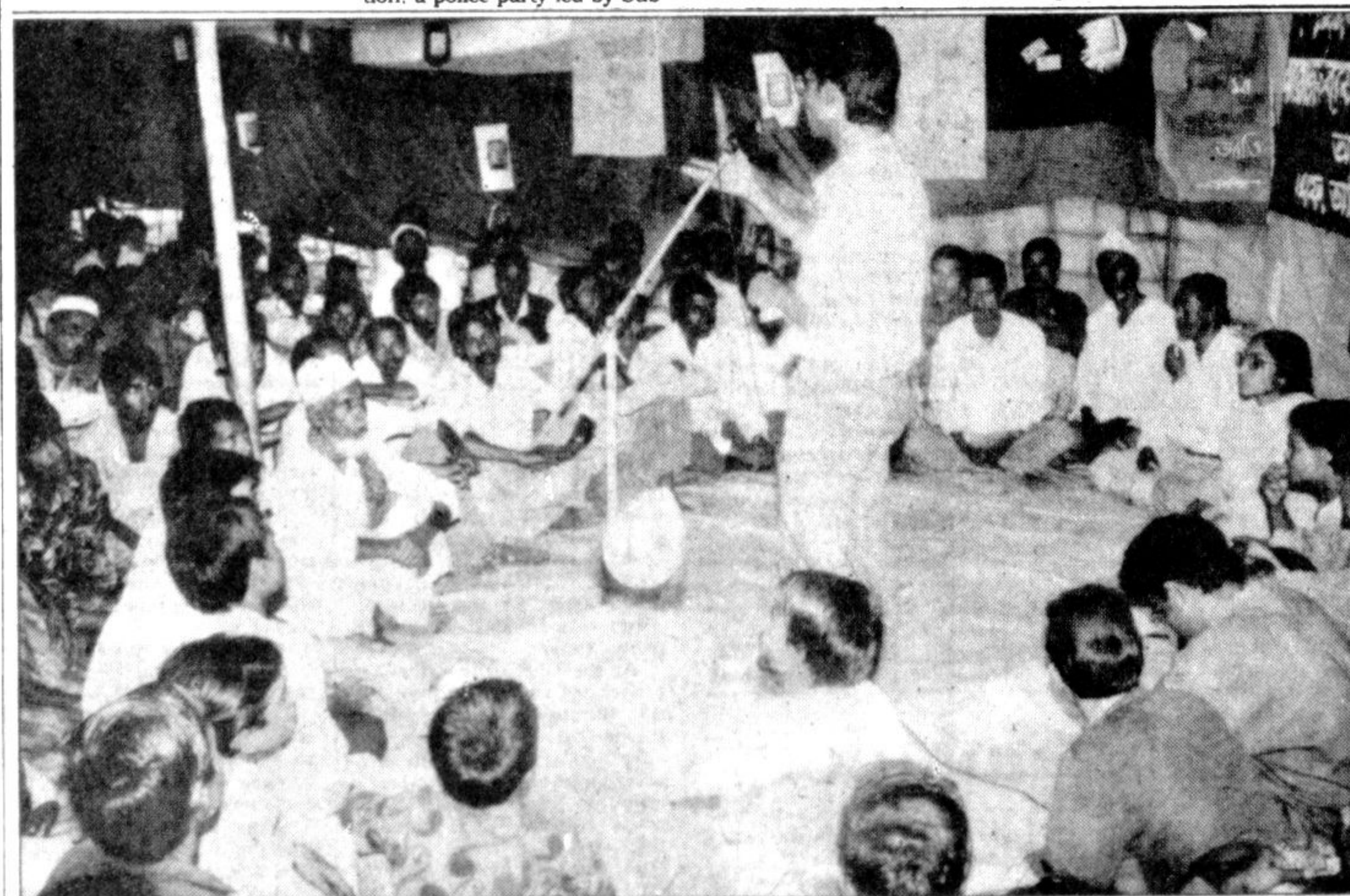
We were illiterate. Now we can read and write and want to learn more." This is the expression of some people who recently have learnt to read and write. An officer of Practical Education Programme (standing) is speaking at a conference of the learners at village Atgram of Sylhet district.

Mokbul Hossain (32), who received stab injuries, was admitted to a local hospital in serious condition.