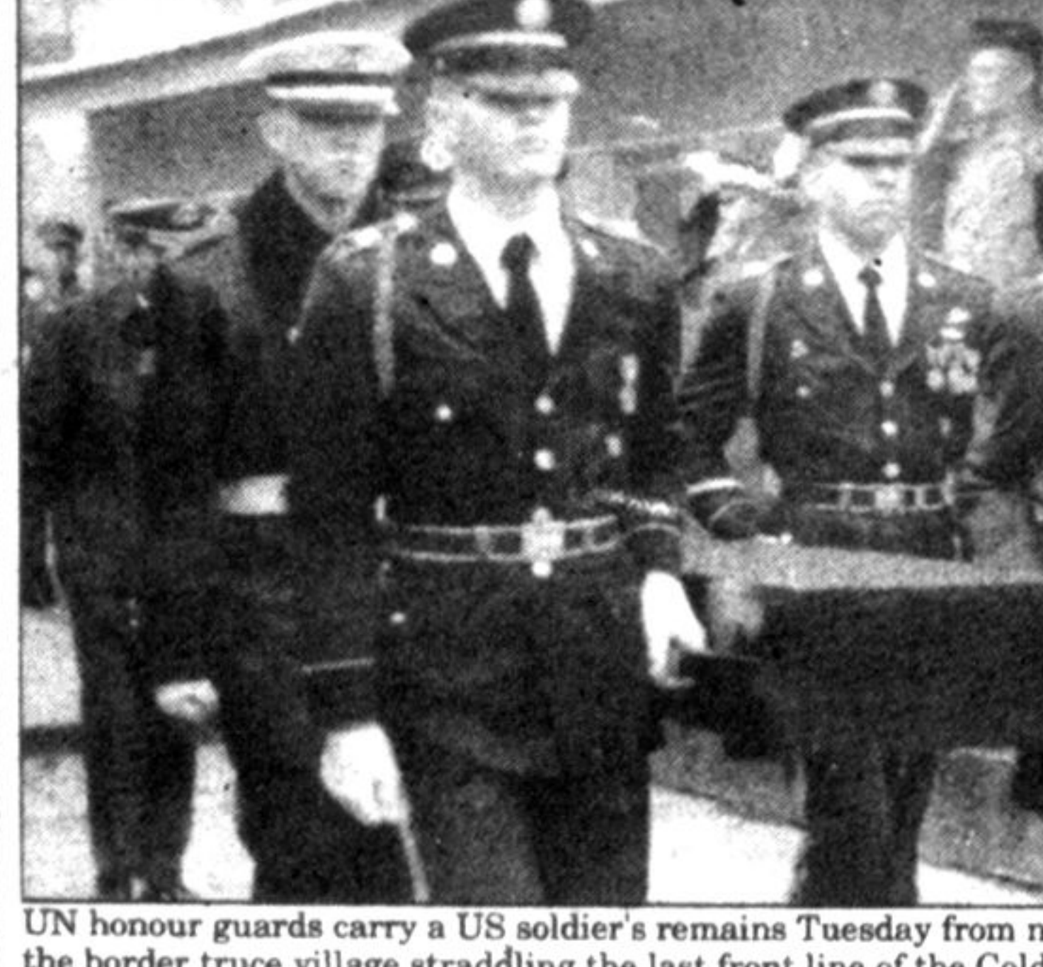
UN honour guards carry a US soldier's remains Tuesday from northern to southern Panmunjom, the border truce village straddling the last front line of the Cold War.