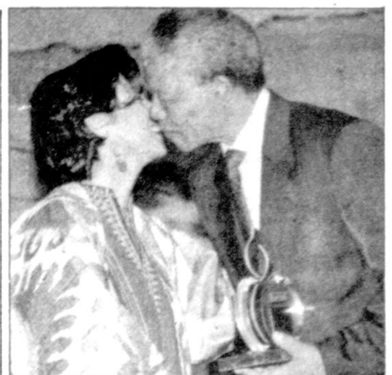
Shabana Azmi (L), Indian actress who with Mother Teresa received an international human rights award from French President Francois Mitterrand in 1989, kisses ANC President Nelson Mandela after presenting him with a newspaper on the year's award on behalf of a Cape Town newspaper on Monday.

LONDON, Nov 30: Britain, forced into revealing secret exchanges with the IRA, appears to have kept the door open for more dialogue with Republican guerrillas in Northern Ireland, reports Reuter.