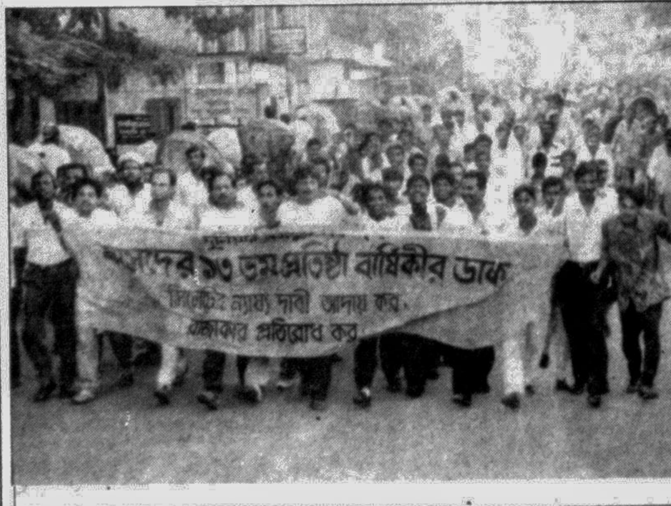
SYLHET: A rally was brought out at the town in observance of the founding anniversary of Bangladesh Samajtantrik Dal on November 9.