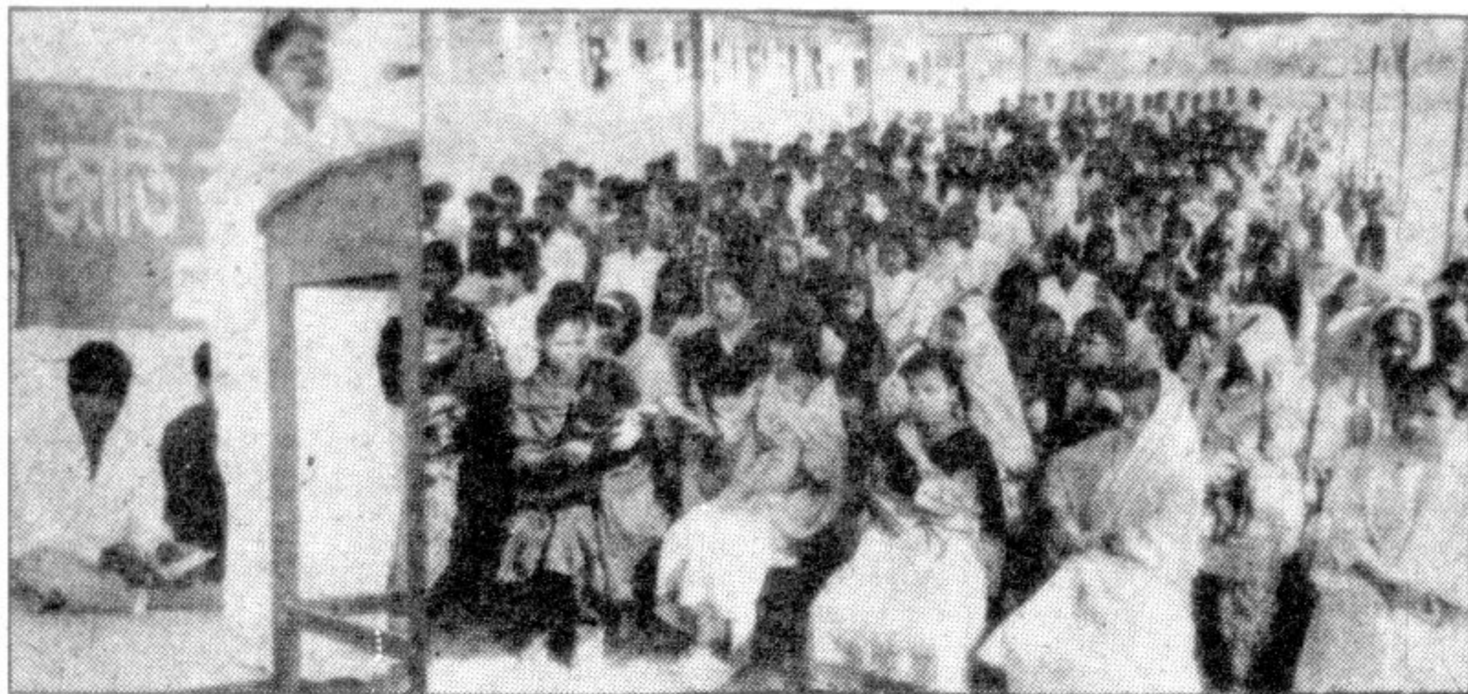
SYLHET: Matia Chowdhury MP speaking as chief guest at the refreshers reception arranged by the Bangladesh Chhatra League (M-I) at Jaintapur College recently.

The loan will be given for socio-economic development of the landless and destitute people of the districts, sources added.