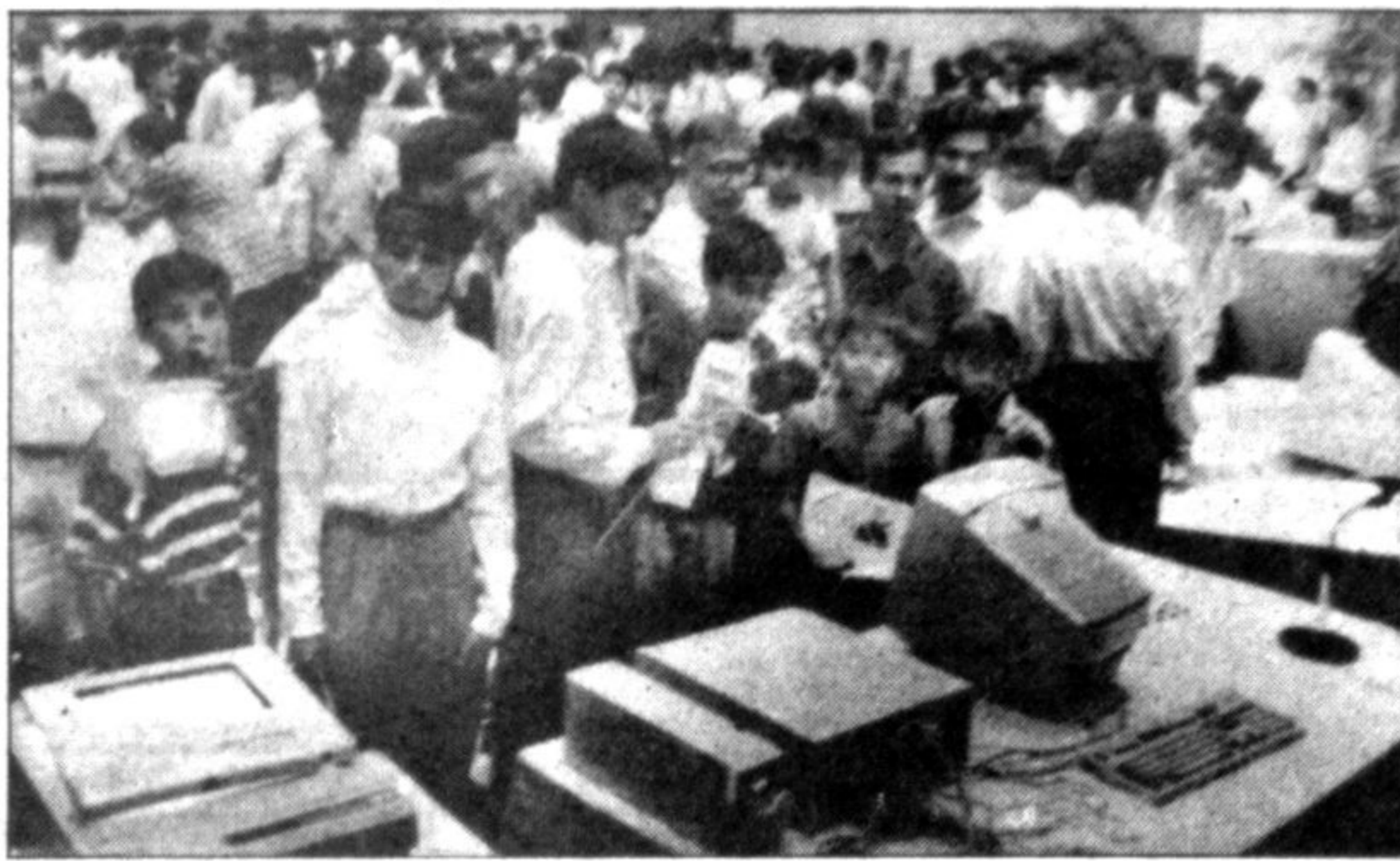
A rush of visitors at the last day yesterday of two-day computer show at Hotel Sonargaon organized by the Bangladesh Computer Samity.

All the arrested people were produced before court.