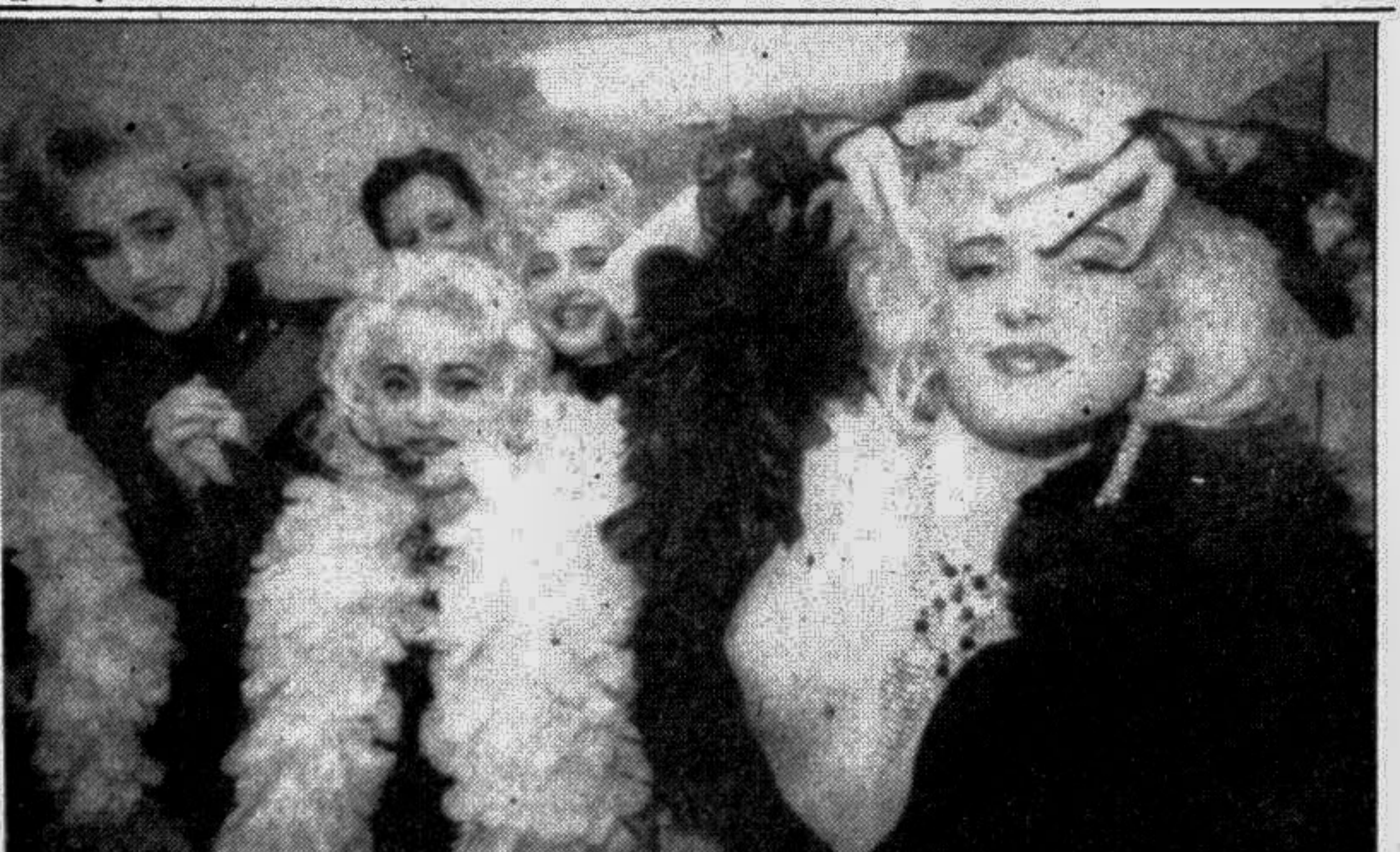
Young Russian Madonna look-alikes strike a pose late Thursday during a singing competition organised by a European radio station. The American superstar is much admired by many female Muscovites following the opening of the country to western tastes.

Hosokawa succeeded in passing the crucial bills through the lower house last week. He has visited South Korea and the United States this month.