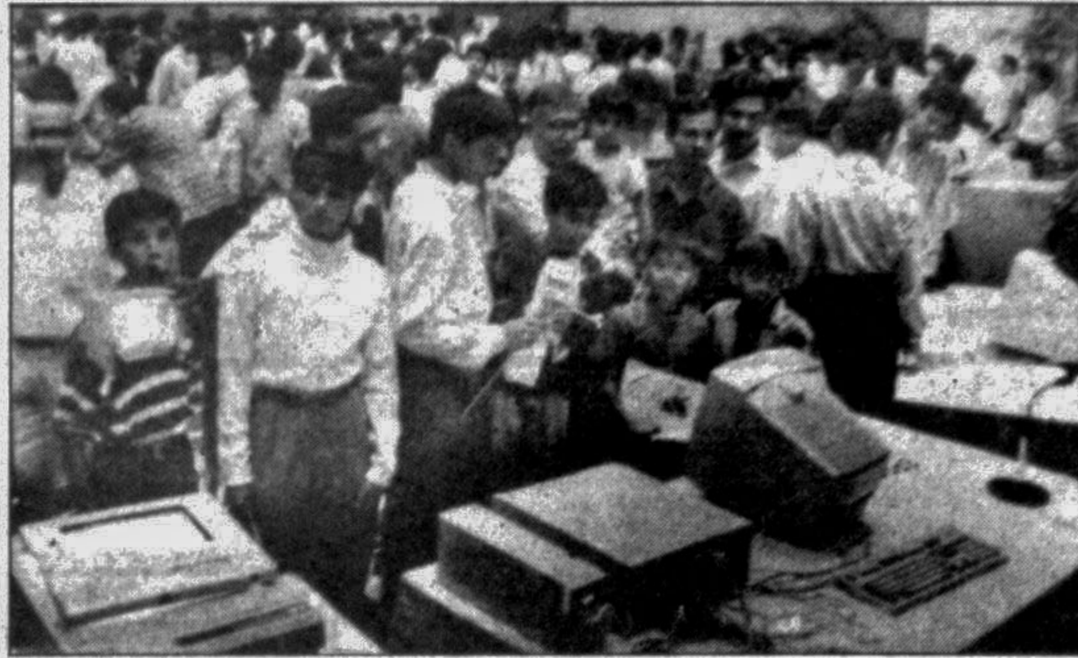
A rush of visitors at the last day yesterday of two-day computer show at Hotel Sonargaon organized by the Bangladesh Computer Society.

However, back to the road. You do a double take and pull up short, stuttering and stammering. "But — but, the road has just been fixed" and the mayor did promise to fix all the roads within fifteen days' you manage to garble in indignation, because you can just visualize the finance bill, with a fatter road tax, presented by the esteemed gentleman in charge of the finances, at the end of the fiscal year, or whatever they like to call these things. The little chaps seem to be completely oblivious of everything and everybody, most certainly the directives of the guardians of the city precincts. What is the idea behind the rhetorics of fixing the roads when even as the grand declarations are being made and the road rollers creating mayhem on the city roads, trying to fix them during the peak hours, because they must sleep during the nights, the diggers are creating mayhem on the other end, by digging up everything that has just been fixed? Meanwhile of course, we the ordinary mortals grind our teeth and bear it. Or try to till election time.