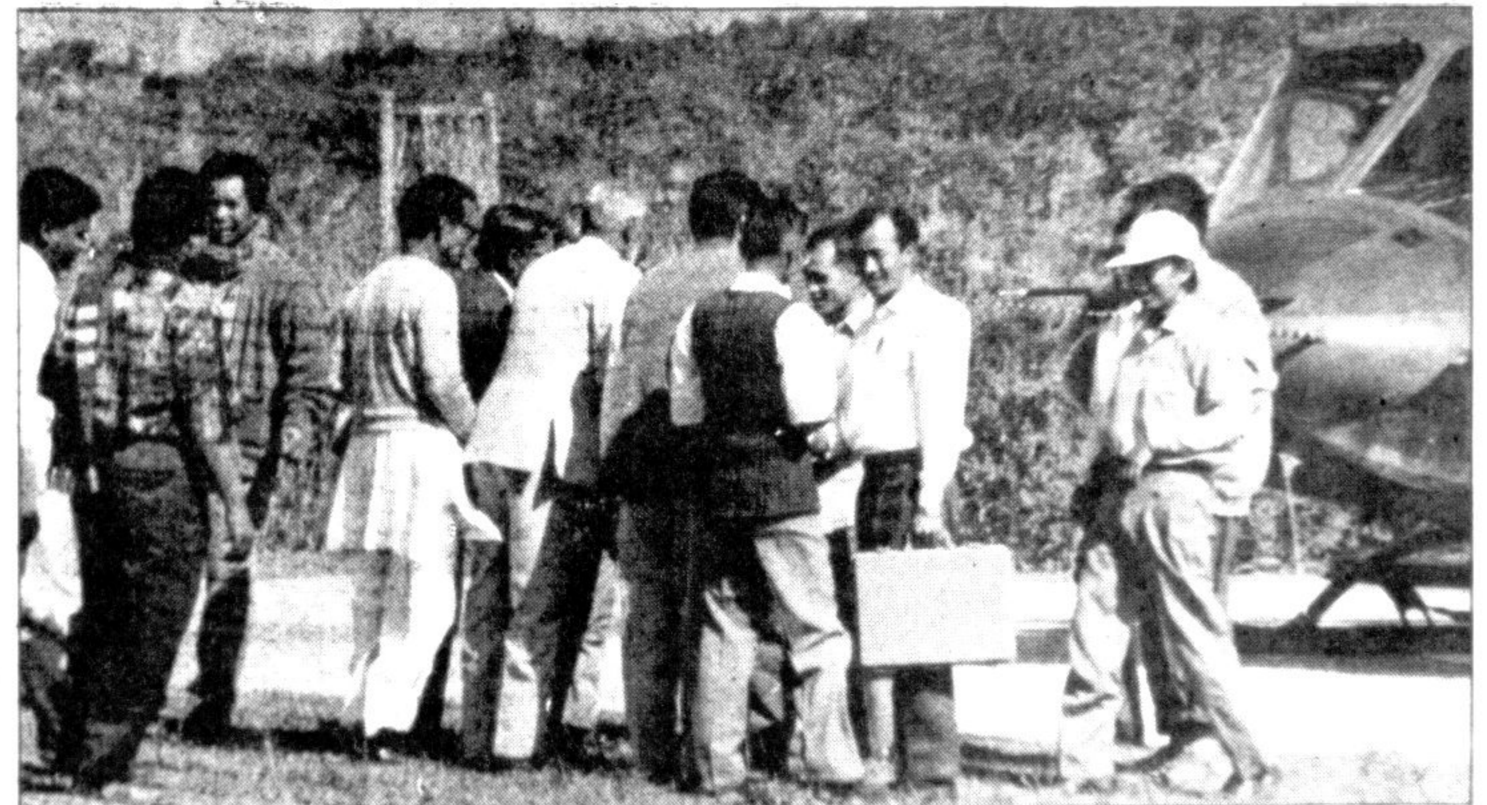
The local administrative body is seen receiving the PCJSS delegation leaders at the helipad ground prior to the peace talks.