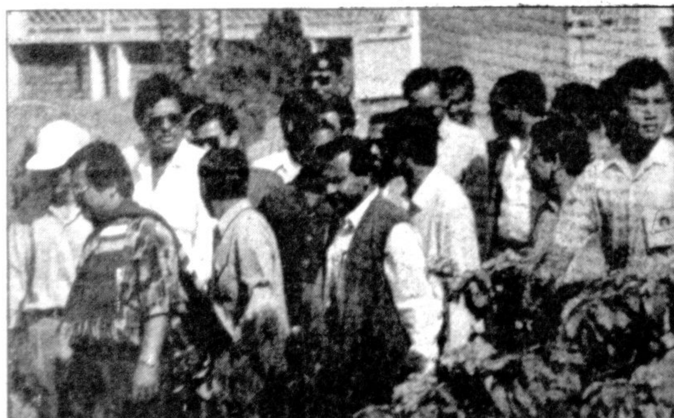
The PCJSS leaders are seen surrounded by the volunteers, selected by the Shantibahini forces.