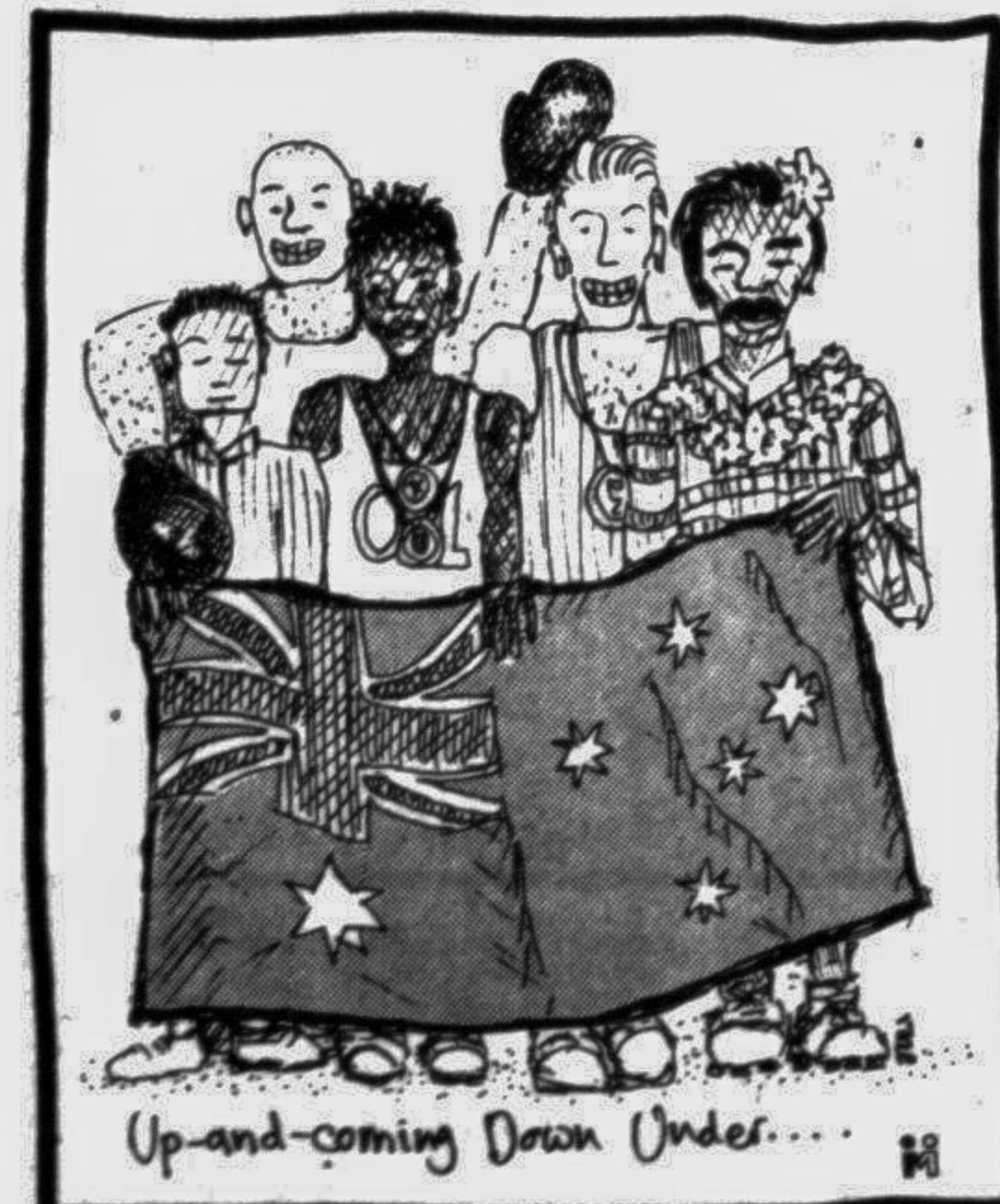
Up-and-coming Down Under...

The qualifying tournament began in the summer of 1992 and ended last week after determining the last of the 24 finalists at next year's championship in the United States.