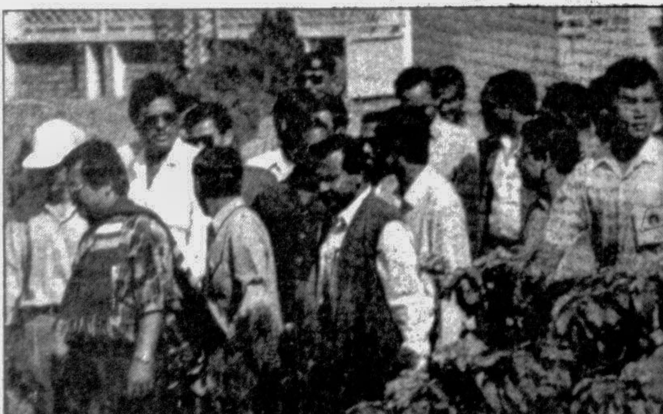
The PCJSS leaders are seen surrounded by the volunteers, selected by the Shantibahini forces.