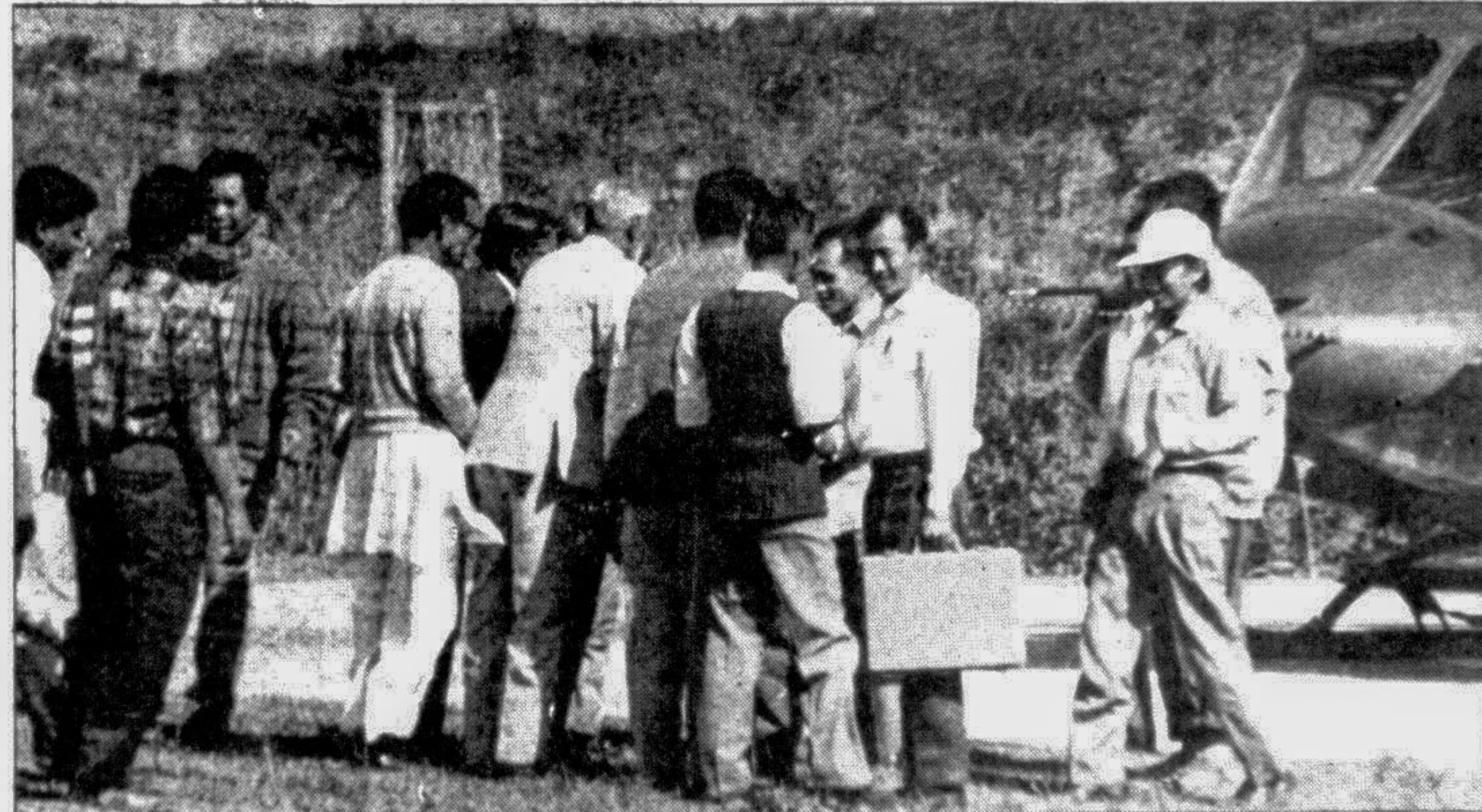
The local administrative body is seen receiving the PCJSS delegation leaders at the helipad ground prior to the peace talks.