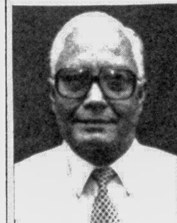
ASM Khaled dead