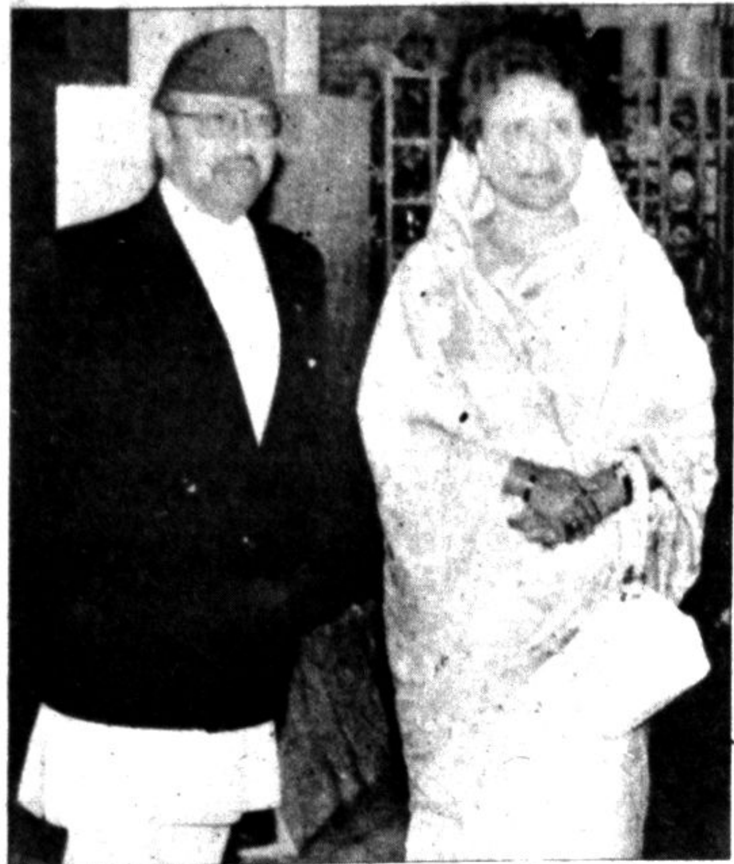
King Birendra of Nepal poses with Prime Minister Begum Khaleda Zia during an audience in Kathmandu yesterday.