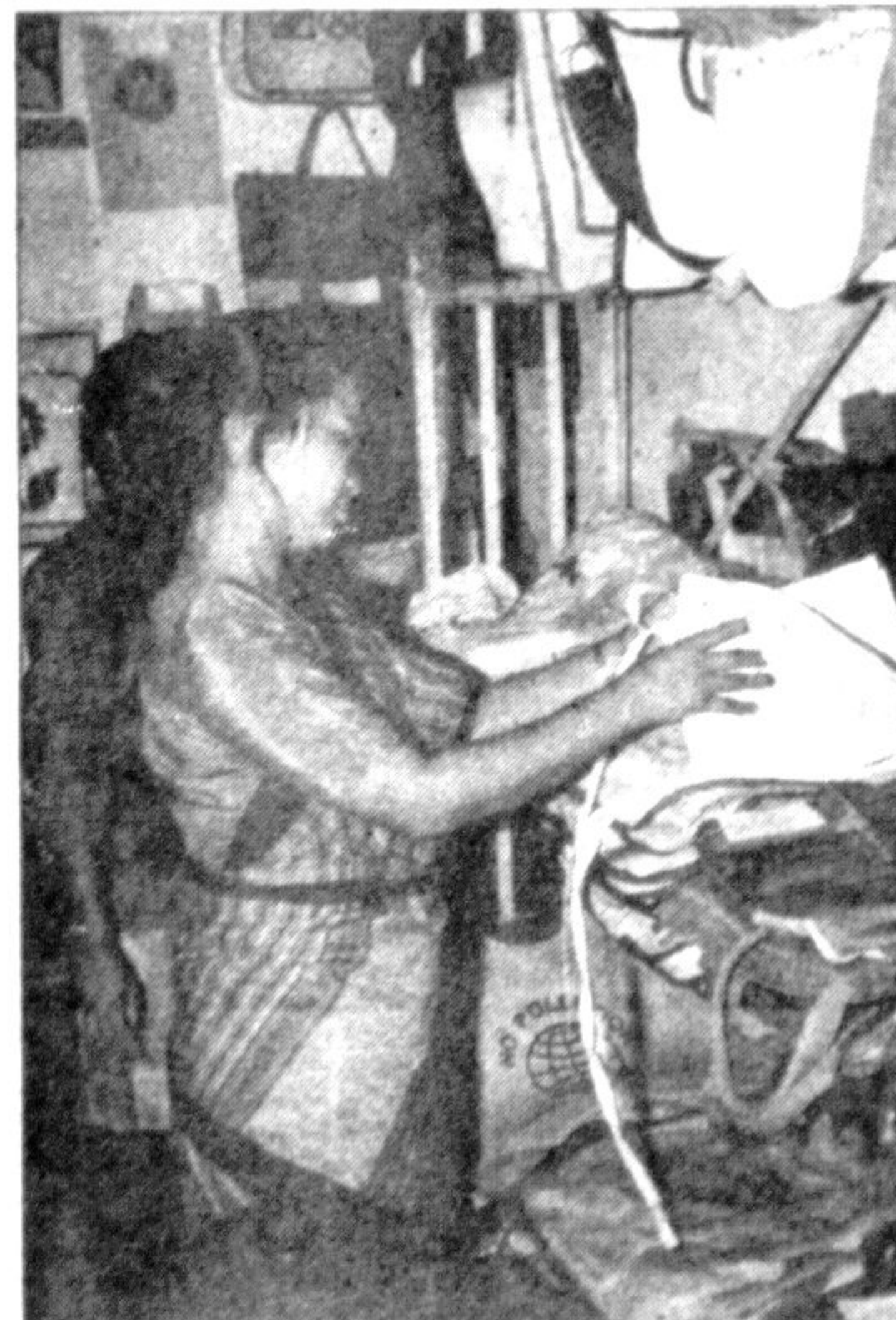
Customers at a stall of the six-day-long industrial fair '93 in Chittagong.