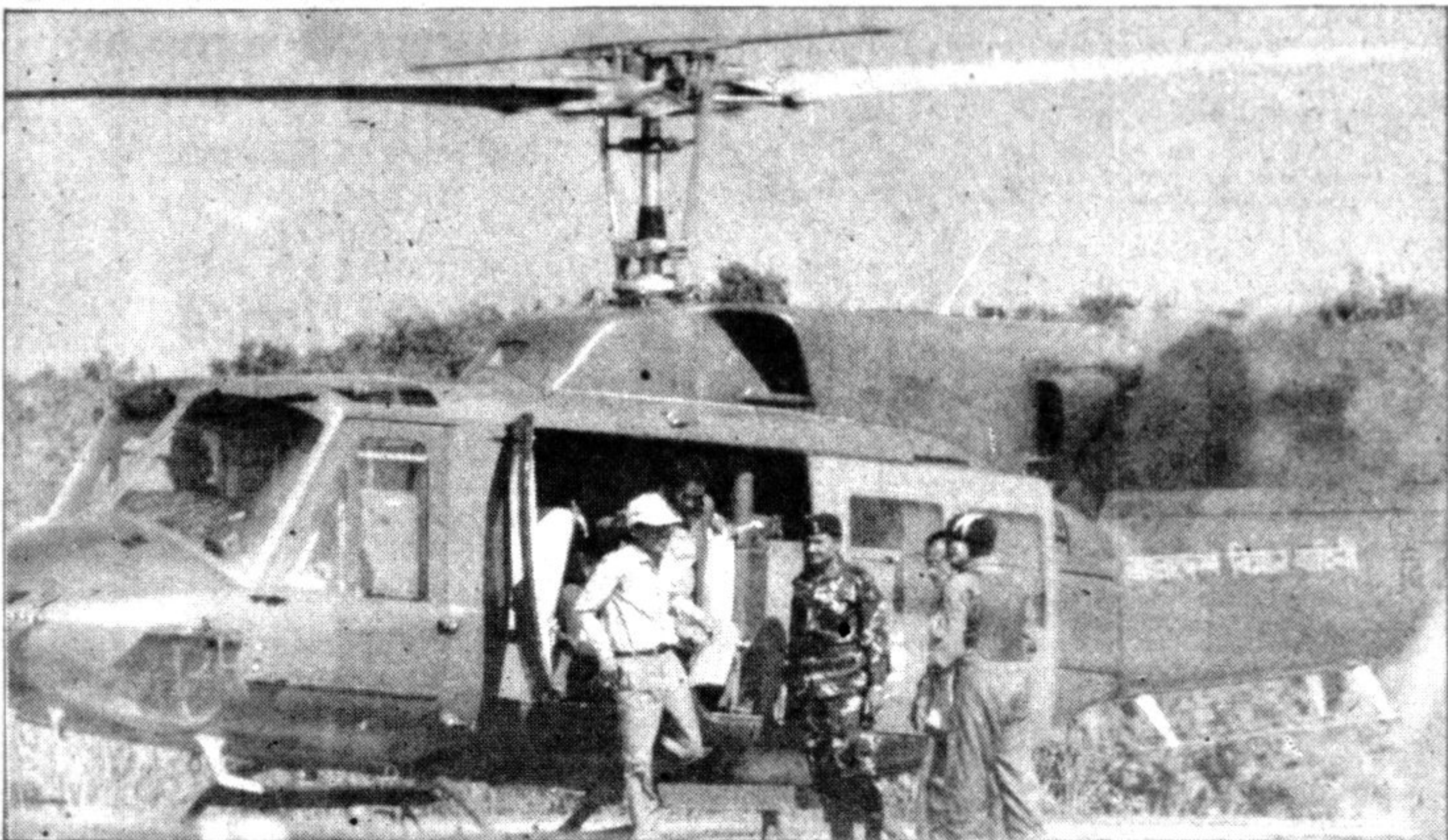
The Shantibahini delegation is seen alighting from a BAF helicopter to attend the sixth round of CHT peace talks at the Khagrachhari Circuit House yesterday.