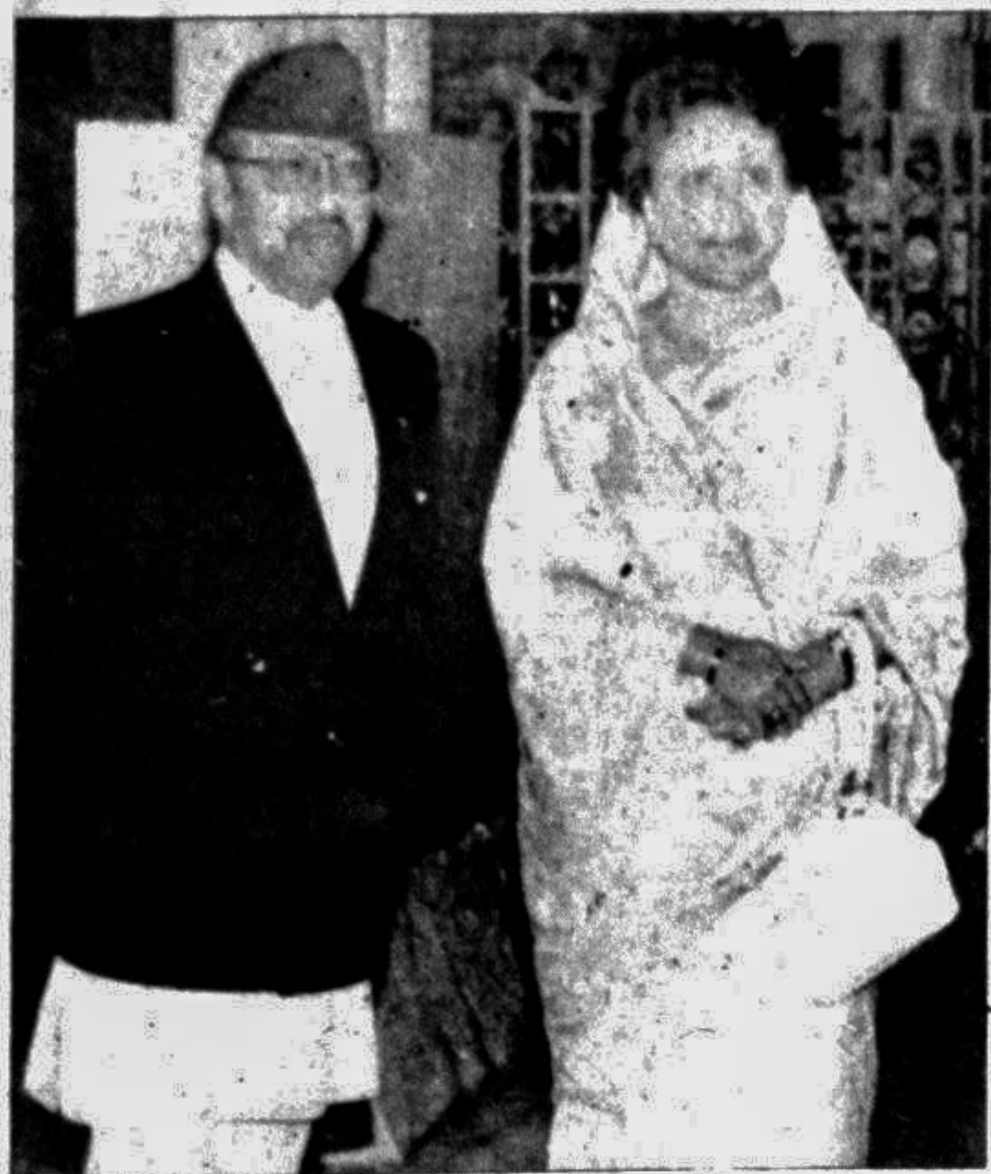
King Birendra of Nepal poses with Prime Minister Begum Khaleda Zia during an audience in Kathmandu yesterday.