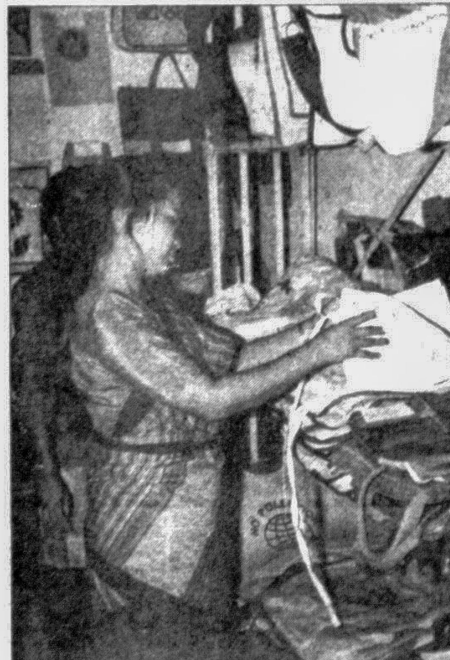
Customers at a stall of the six-day-long industrial fair '93 in Chittagong.