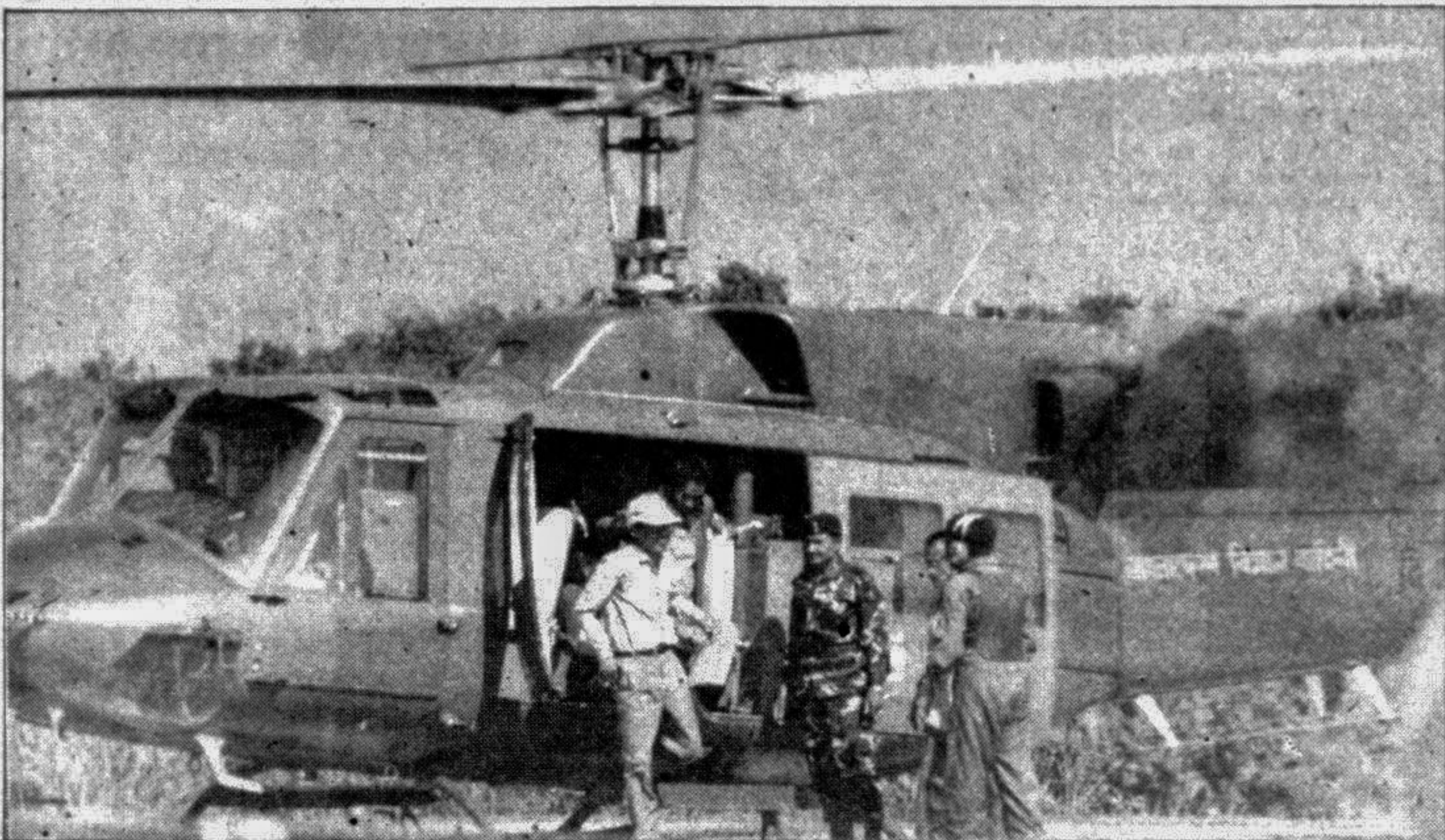
The Shantibahini delegation is seen alighting from a BAF helicopter to attend the sixth round of CHT peace talks at the Khagrachhari Circuit House yesterday.