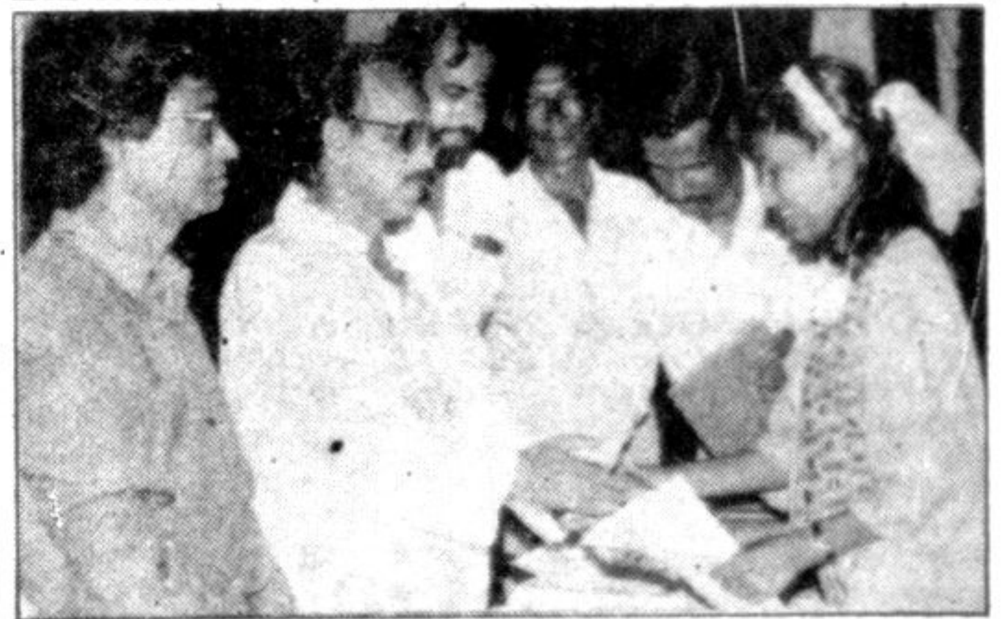
SYLHET: A-winner of Maushumi contest is receiving prize from the ADM recently.

Local people informed finding no other alternative, a large number of young girls is pouring into the thana and district headquarters to earn their livelihood. Having failed to get any job, many of them are resorting to immoral activities.