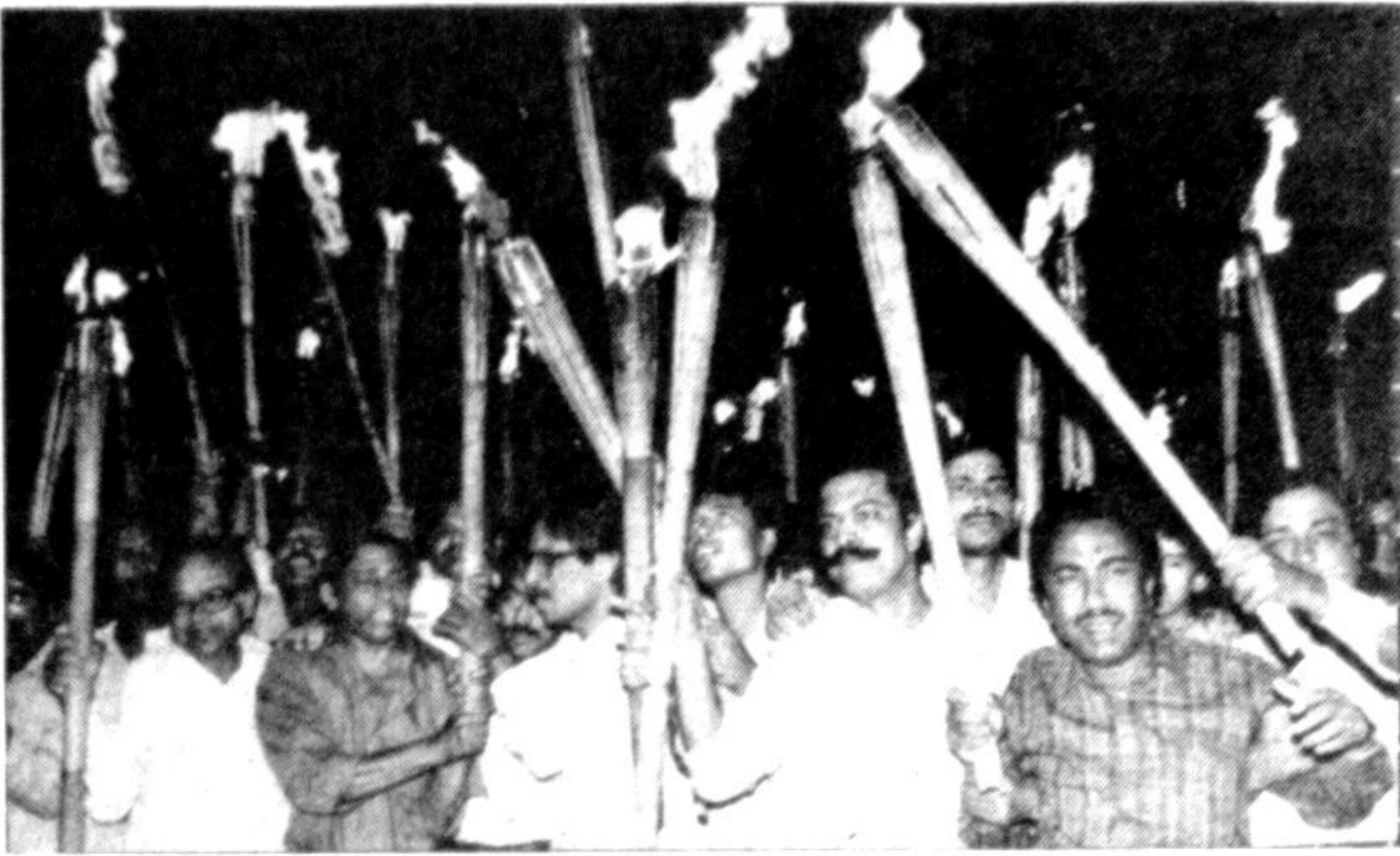
Ekattorer Ghatok Dalal Nirmul Jatiya Samannay Committee brought out a torch procession in the city yesterday in support of its today's march toward parliament programme.