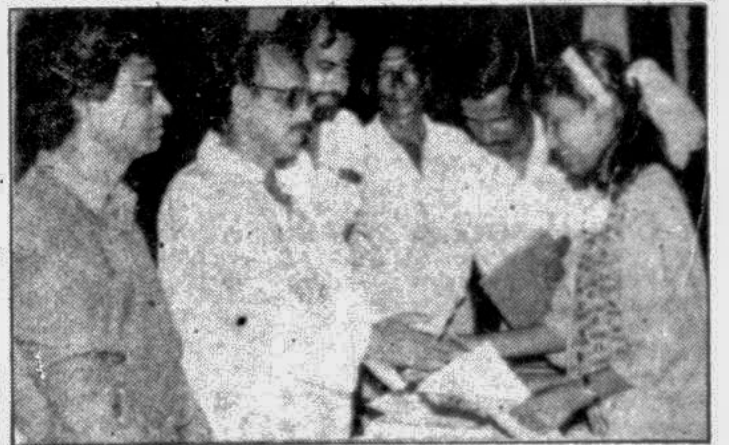
SYLHET: A winner of Maushumi contest is receiving prize from the ADM recently.

Local people informed finding no other alternative, a large number of young girls is pouring into the thana and district headquarters to earn their livelihood. Having failed to get any job, many of them are resorting to immoral activities.