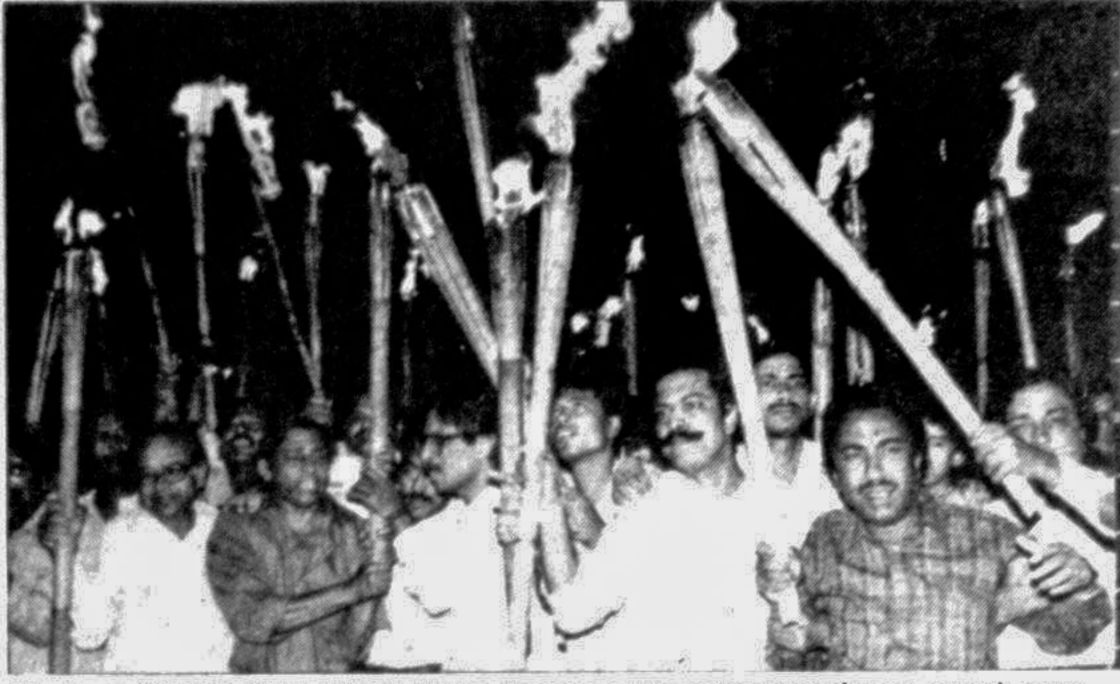
Ekattorer Ghatok Dalal Nirmul Jatiya Samannay Committee brought out a torch procession in the city yesterday in support of its today's march toward parliament programme.