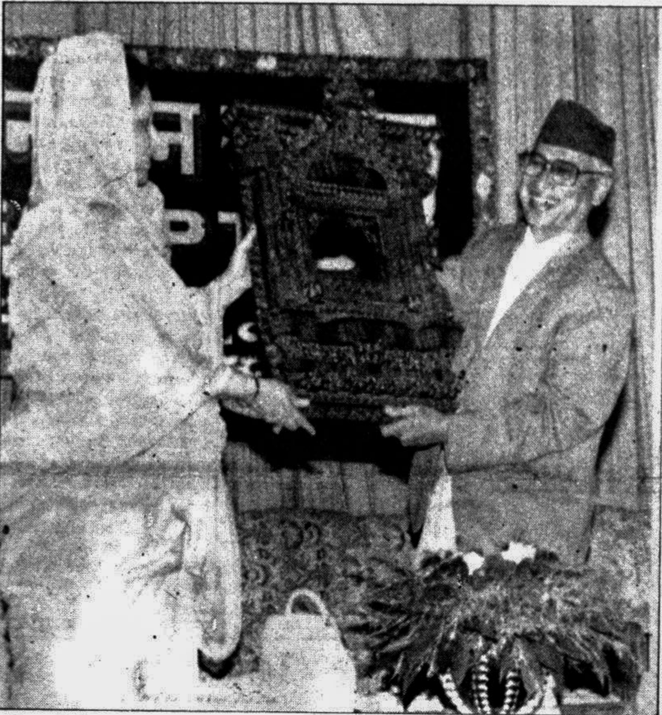
Prime Minister Begum Khaleda Zia receiving a carved wooden window from the Mayor of Kathmandu P L Singh yesterday during a civic reception held in her honour in the Nepalese capital.