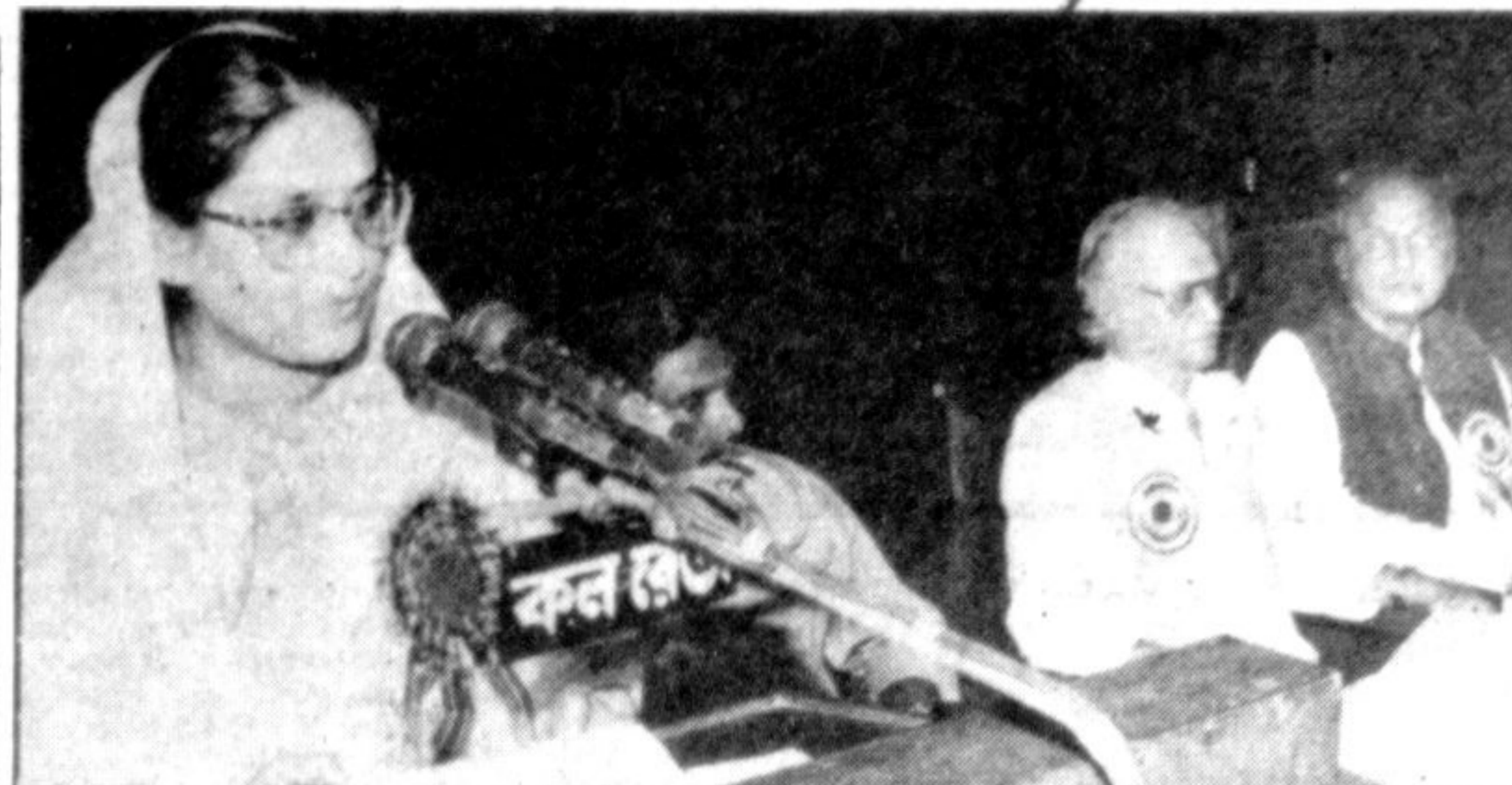
Awami League chief and Leader of the Opposition in Parliament Sheikh Hasina speaking at a seminar on education organised by her party at the Institute of Engineers yesterday.