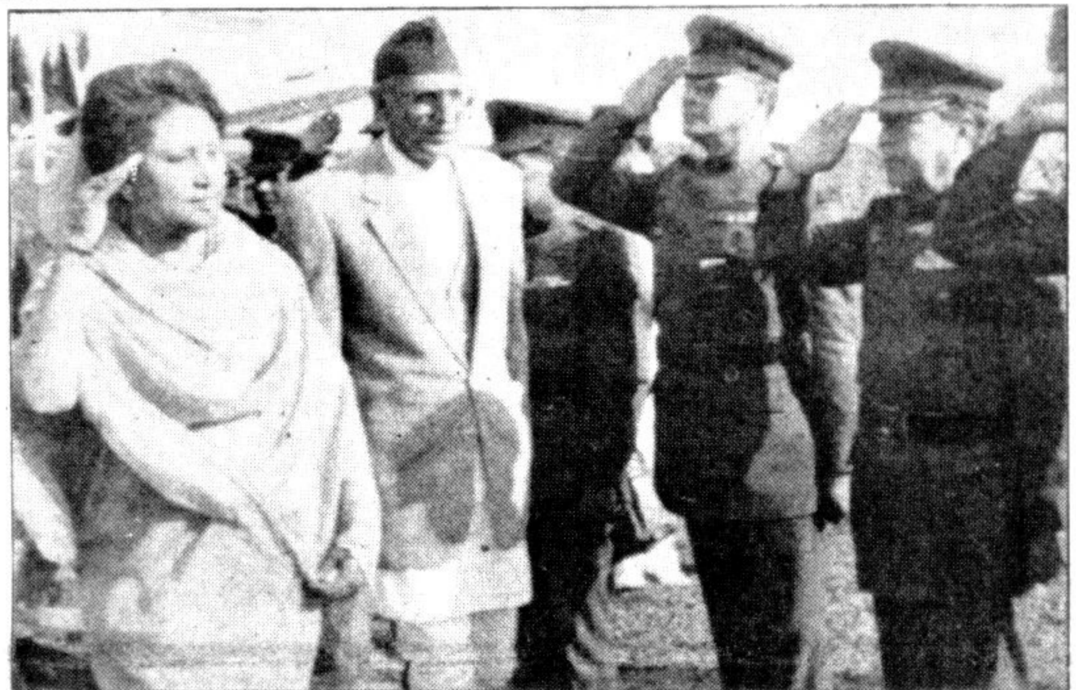
Prime Minister Begum Khaleda Zia (L) taking salute during a welcoming ceremony on her arrival in the Nepalese capital Kathmandu yesterday. Nepalese Prime Minister Girija Prasad Koirala is seen on her left.

"We must stand together within the framework of the SAARC", Begum Zia said.