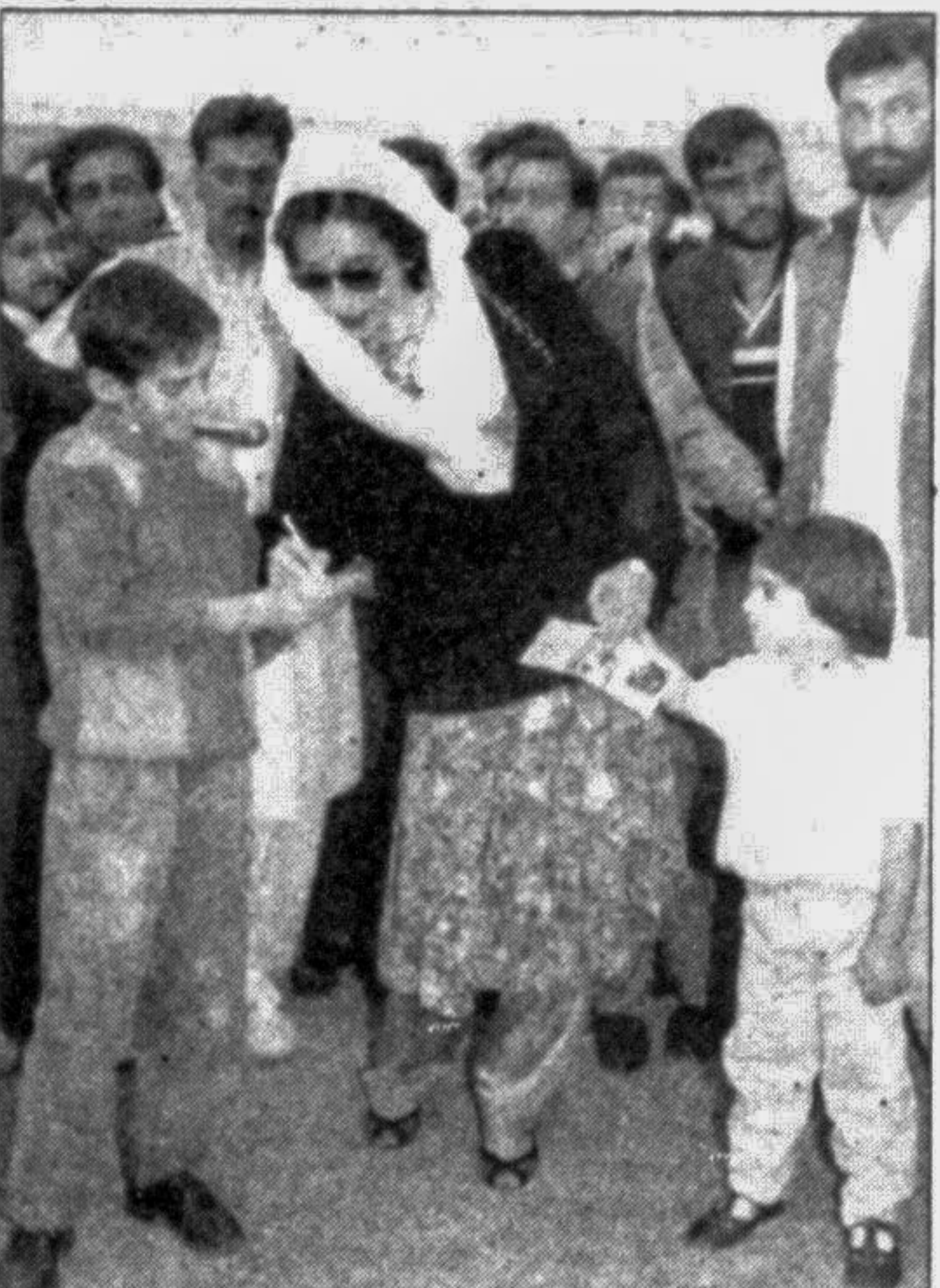
Pakistan's Prime Minister Benazir Bhutto (C) holds her daughter Bakhtawar's (R) hand while signing an autograph for a boy (L, unidentified) during an universal children's day celebration in Islamabad Sunday. Bhutto said that the government would make all efforts to provide basic education to all the children.

"A rollback is neither possible nor feasible," Benazir Bhutto says.