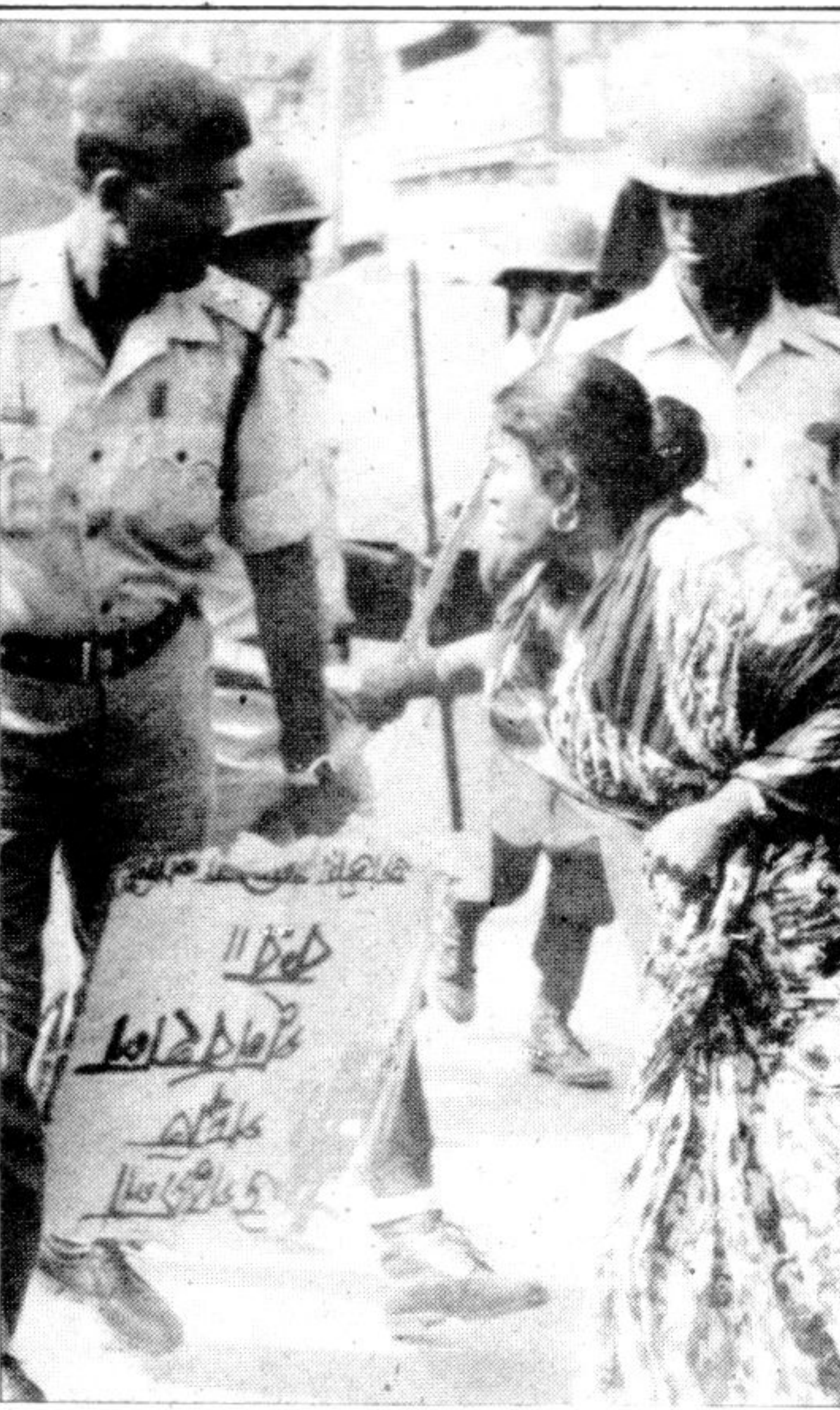
Police taking away posters, festoons from the Jatiya Mahila Party (JMP) processionists in the city yesterday.