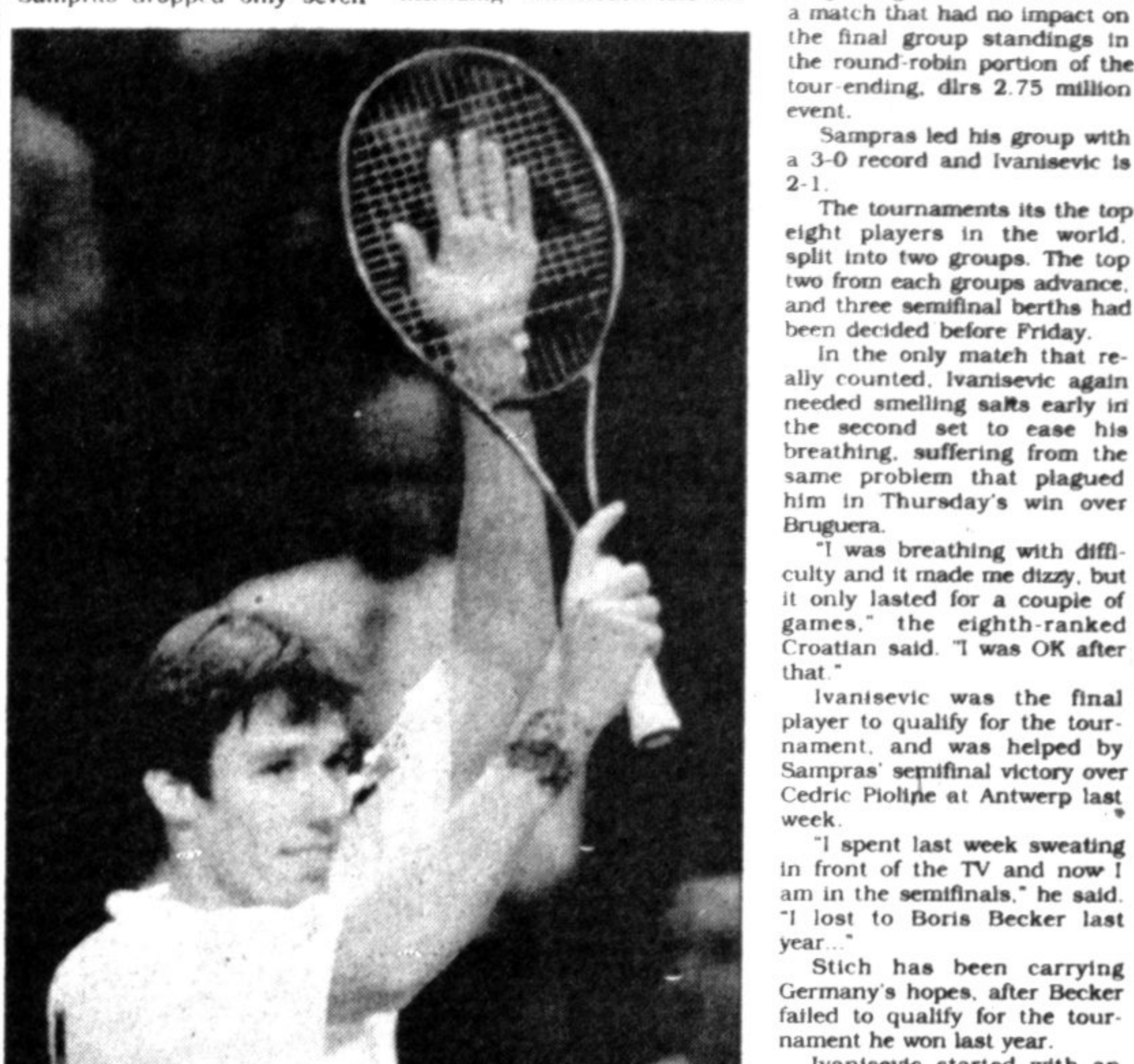
Germany's Michael Stich acknowledges the cheers from his home crowd after defeating American Jim Courier 7-5, 6-4 at the ATP tennis tournament in Frankfurt, Germany on Nov 19.