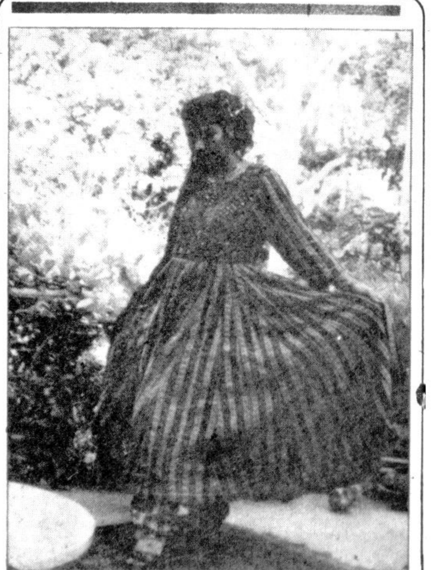
Autumn fashion.