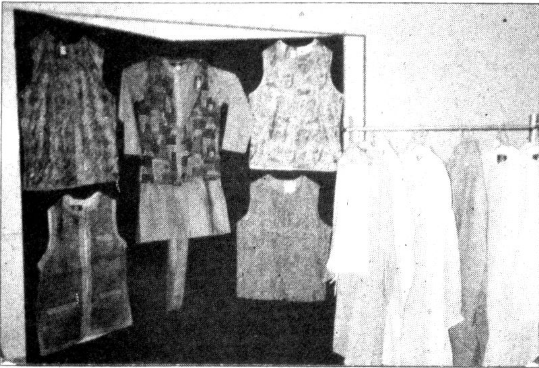
An array of panjabi collection

Bengalis call it panjabi and Panjabis call it Bangali kurta nobody seems to want to claim this garment as his own. Yet the panjabi or kurta , whatever you want to call it, has been the most common male clothing in the sub continent. Whether it is a Bangali Babu over his dhuti , the Maulana Sahib over his pajamas or your next door neighbour over his jeans, the panjabi is regarded as an anytime wear. The panjabi of old used to be confined to light sombre colours — stark white, off white or beige at the most. Nowadays panjabis come in a wide range of colours and designs reflecting the more bold and fashionable male of the nineties.