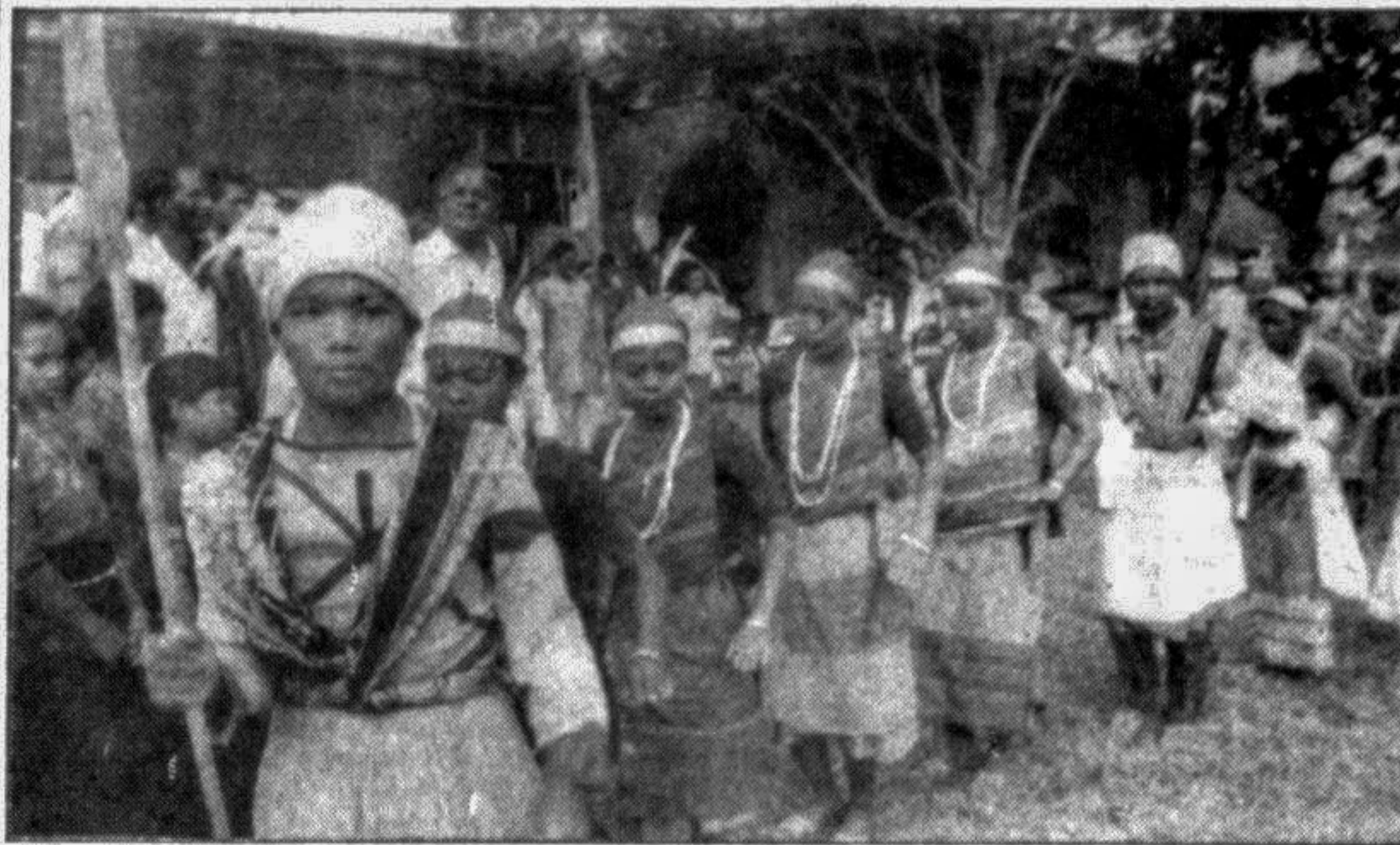
The Tribal Welfare Association brought out a colourful rally in observance of the World Indigenous Year in Mymensingh town yesterday.