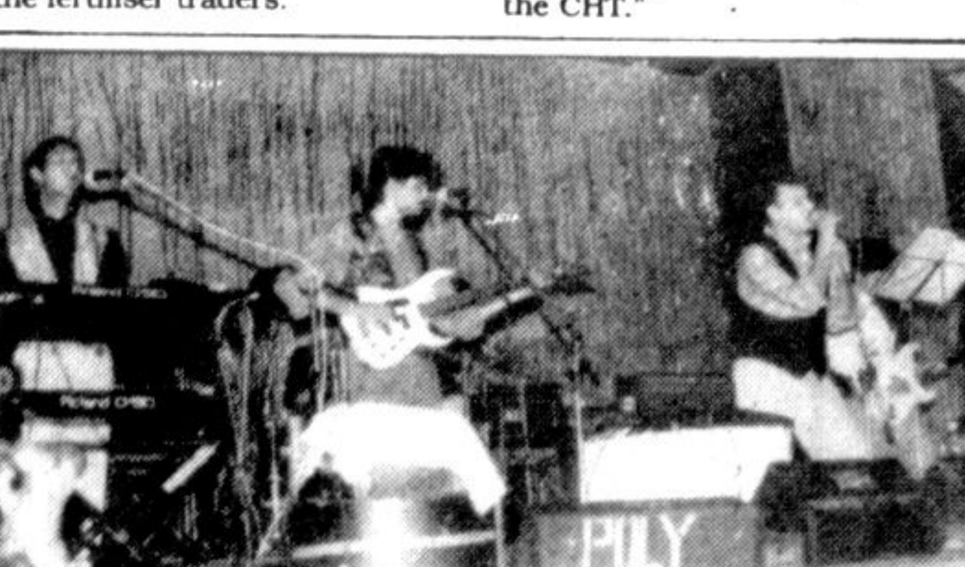
Self Salvation, Bangladesh organised a concert for the disadvantaged children at the Sheraton Hotel yesterday.