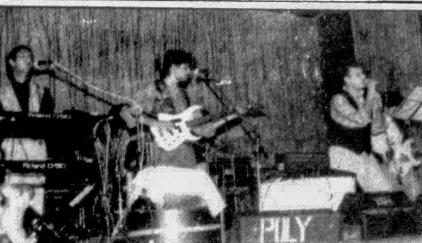
Self Salvation, Bangladesh organised a concert for the disadvantaged children at the Sheraton Hotel yesterday.

The National Committee for the Protection of Fundamental Rights in the Chittagong Hill Tracts condemned the brutal killings in Rangamati on November 17. A press release of the committee said, "We demand the immediate arrest and trial of those responsible for these killings. We demand that steps be taken against the Parbatya Gano Parishad, who are responsible for the repeated provocative attacks and attempts to disturb the peace in the CHT."