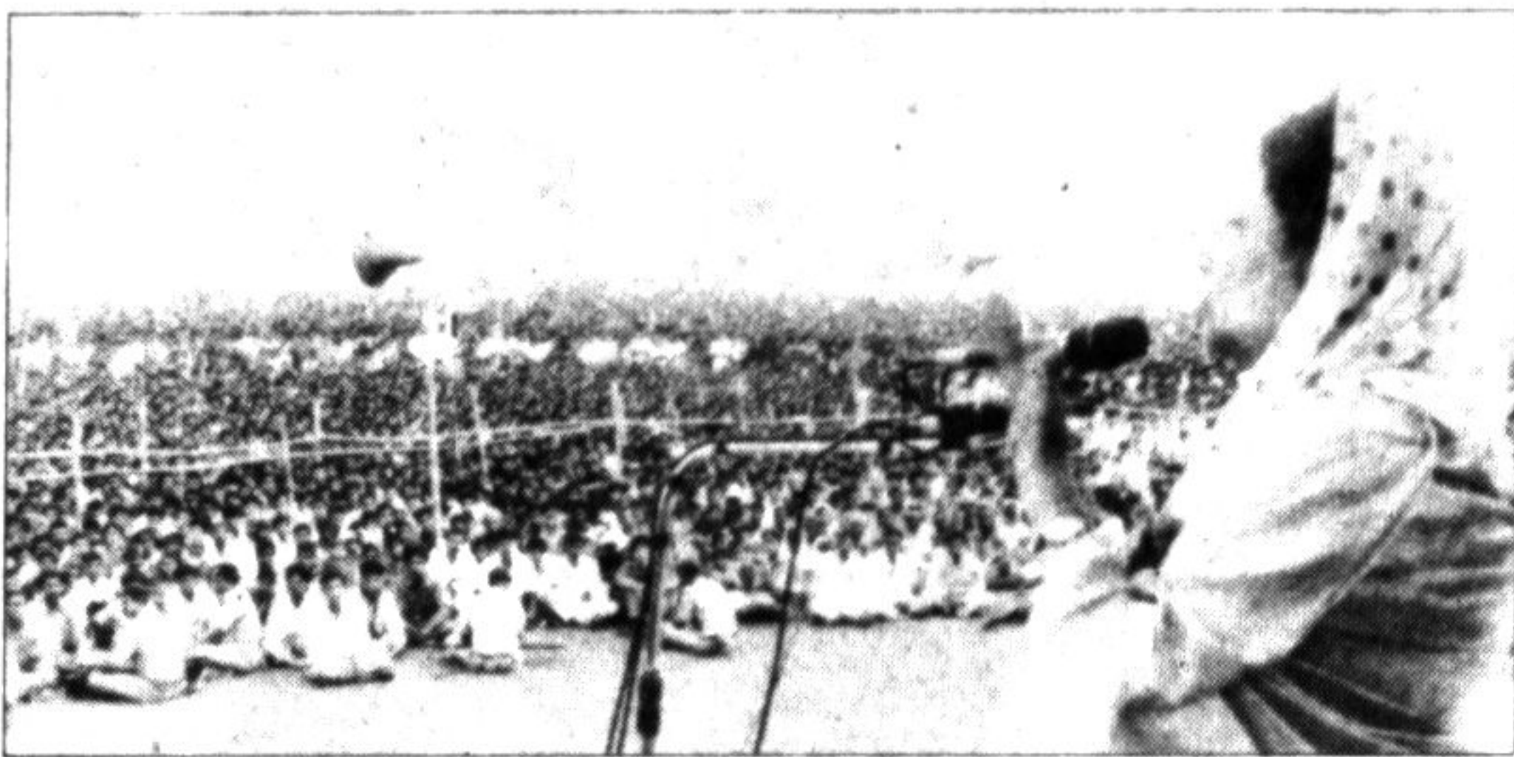
Prime Minister Begum Khaleda Zia addressing a public meeting at the Tanore Dakbungalow ground in Rajshahi yesterday.

suspected rebels are being held, demanding they also be released. The worshippers had been trapped inside the shrine when the army laid siege to it on the night of October 15. A forum of Kashmiri political and militant groups, led by the All-Party Kashmir Freedom Conference, called for a boycott of prayers at the white-marble mosque until the BSF soldiers are withdrawn. Meanwhile, the European parliament today asked Belgium to free as soon as possible Kashmir separatist leader Amanullah Khan, arrested in Brussels last month. Khan, chairman of the Jammu and Kashmir Liberation Front (JKLF), was arrested October 18 because of a 1990 arrest warrant issued against him by Interpol at the request of Indian authorities.