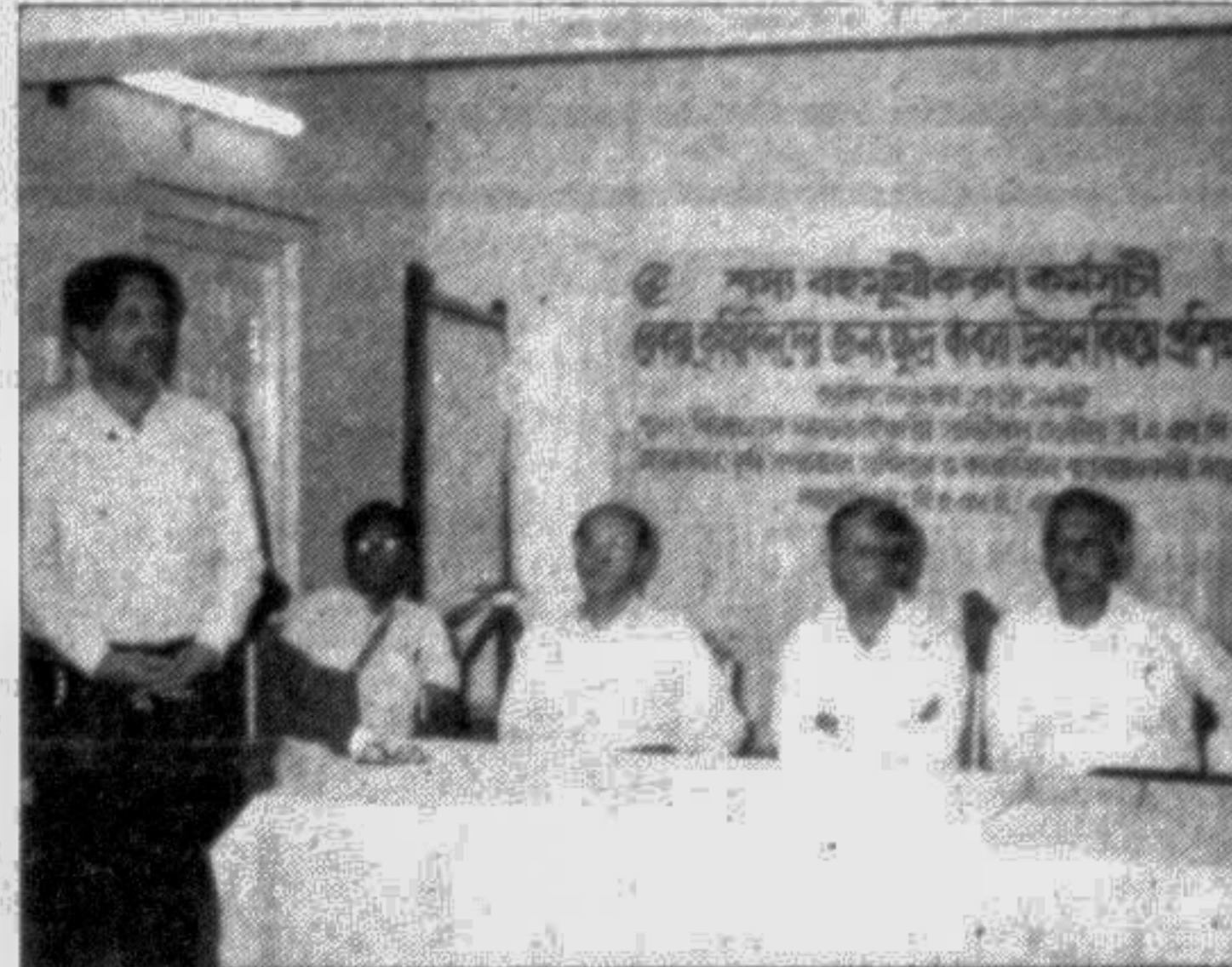
M. Majidul Haque, Minister for Agriculture inaugurated a training course on small scale business development for the unemployed agri-graduates at the Business Advisory Services Centre (BASC) in the city Wednesday.