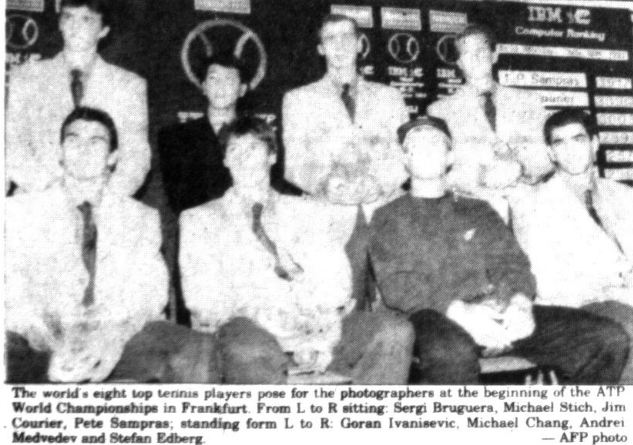
The world's eight top tennis players pose for the photographers at the beginning of the ATP World Championships in Frankfurt. From L to R sitting: Sergi Bruguera, Michael Stich, Jim Courier, Pete Sampras; standing from L to R: Goran Ivanisevic, Michael Chang, Andrei Medvedev and Stefan Edberg.

minutes. The American world number two, who has struggled with his game in recent months after reaching the final of the French Open and Wimbledon earlier in the year, could find no answer to Chang's industry and determination.