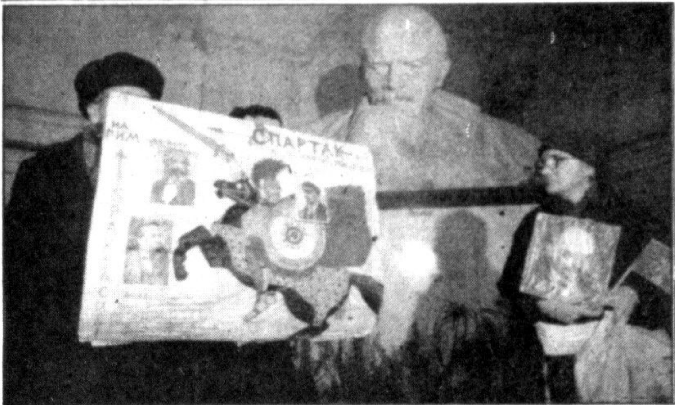
A group of supporters of the Communist Party protest inside the Lenin Museum Tuesday in Moscow. The Russian government signed a decree closing this Museum, which opened in 1936, and the building will be used for the City Council after the December 12 elections.

Hekmatyar's Hezb-i-Islami faction is said to have cut the road as a result of the heavy bombing on civilian as well as military targets in Sarobi Tuesday afternoon, and again Wednesday morning.