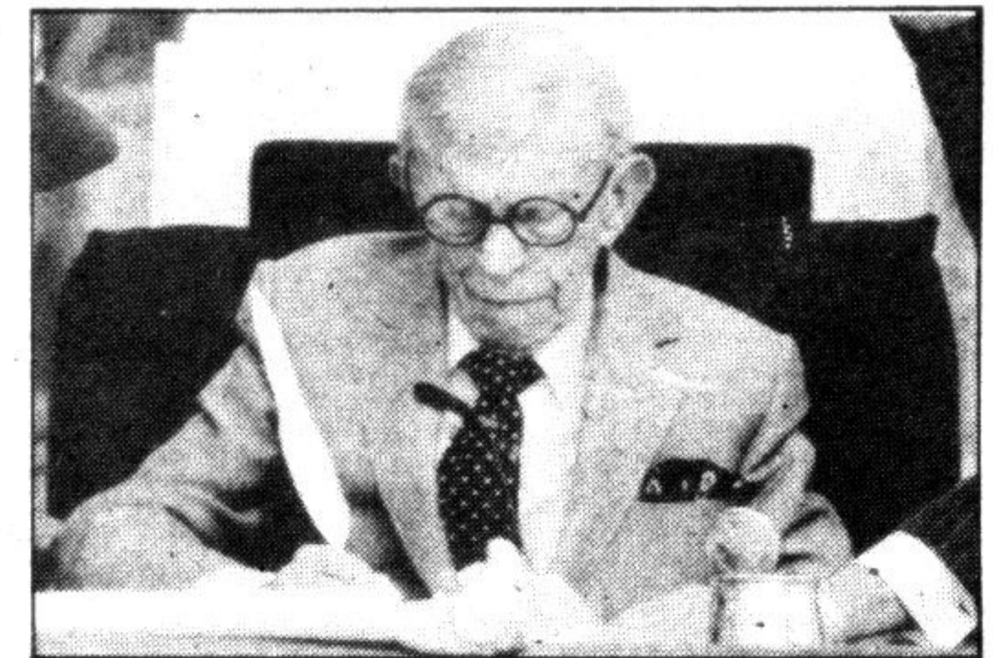
Actor-comedian George Burns signs a contract Tuesday in which he agrees to play an engagement at Caesars Palace Hotel in Las Vegas on November 20, his 100th birthday.

Boutros-Ghali is also asked to "make appropriate provision to deal with the situation of those already detained."